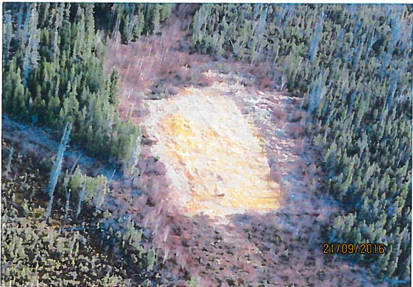
Aerial of N73