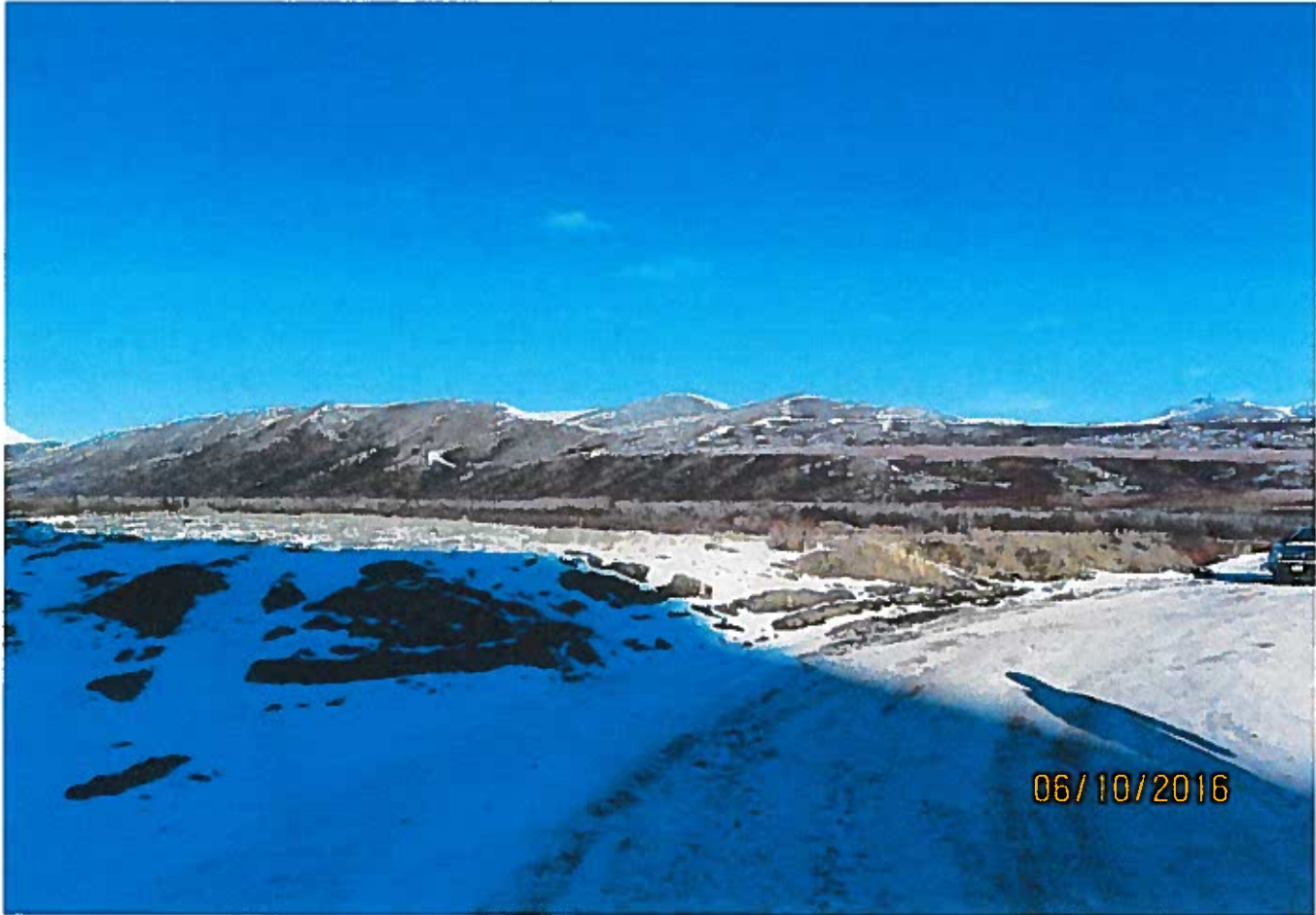
Figure 9 view of land farm