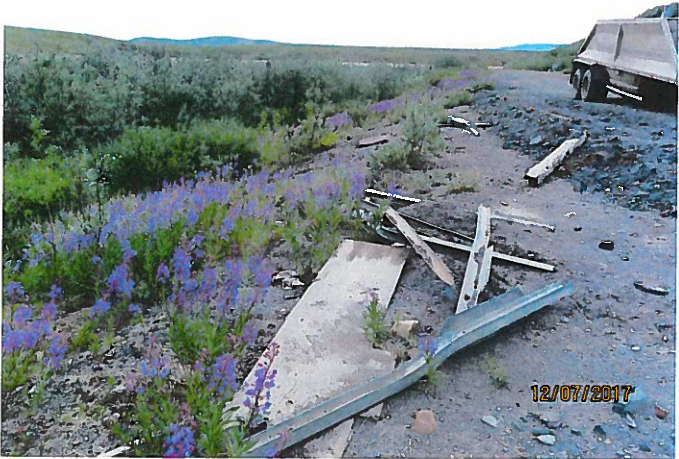
Figure 8 South entrance