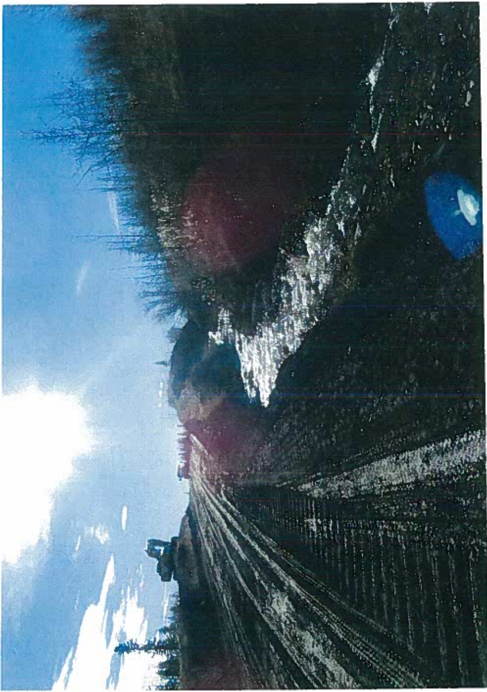
Figure 3 runoff along access road to culvert