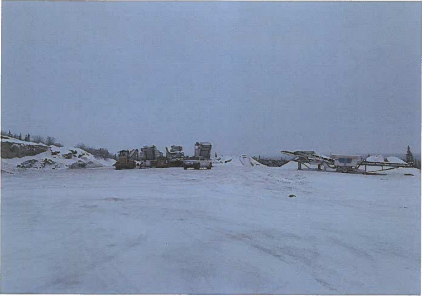
Figure 4 drilling in progress