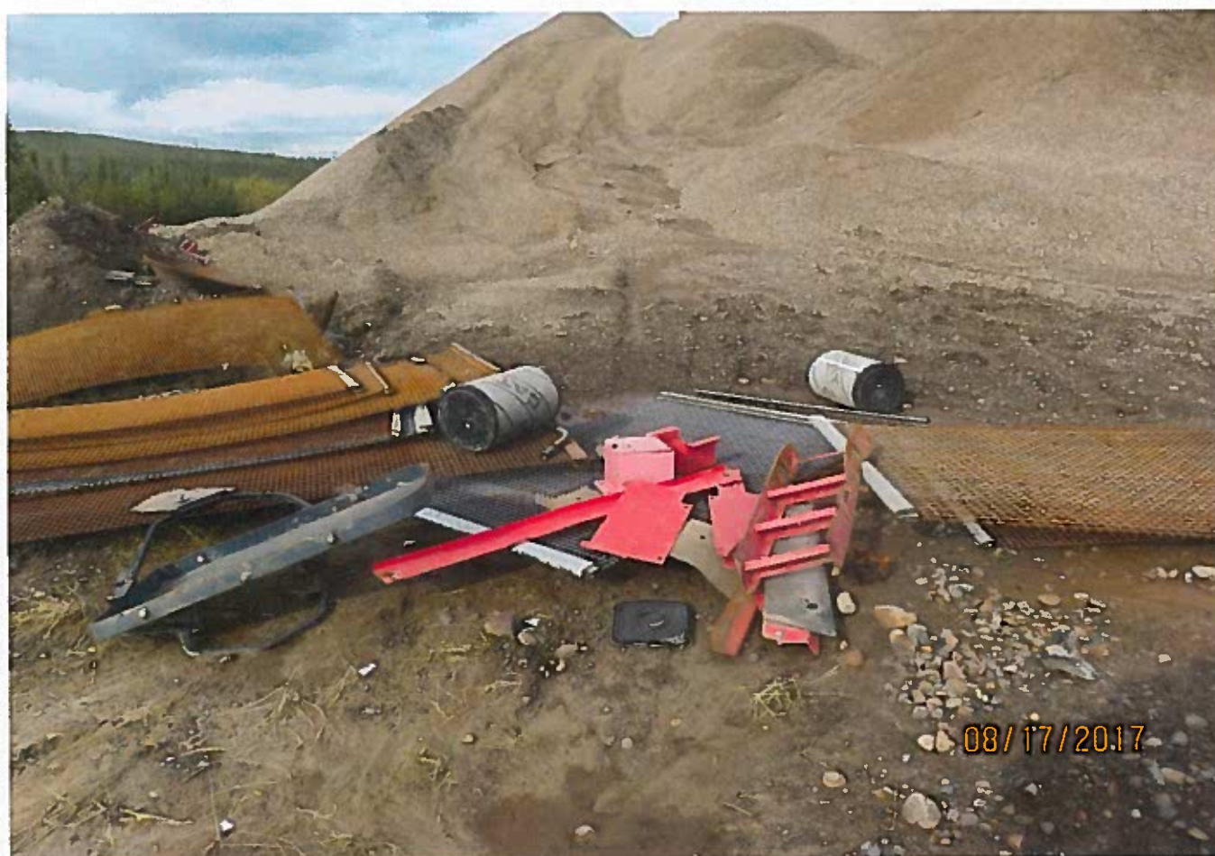
Figure 7 Metal debris