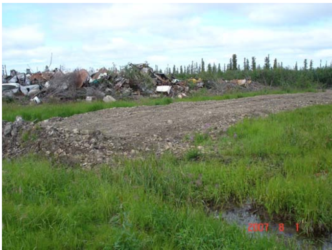
Figure 2 Honey Bag Pit needs to have the berm lengthened so it surrounds the whole pit.