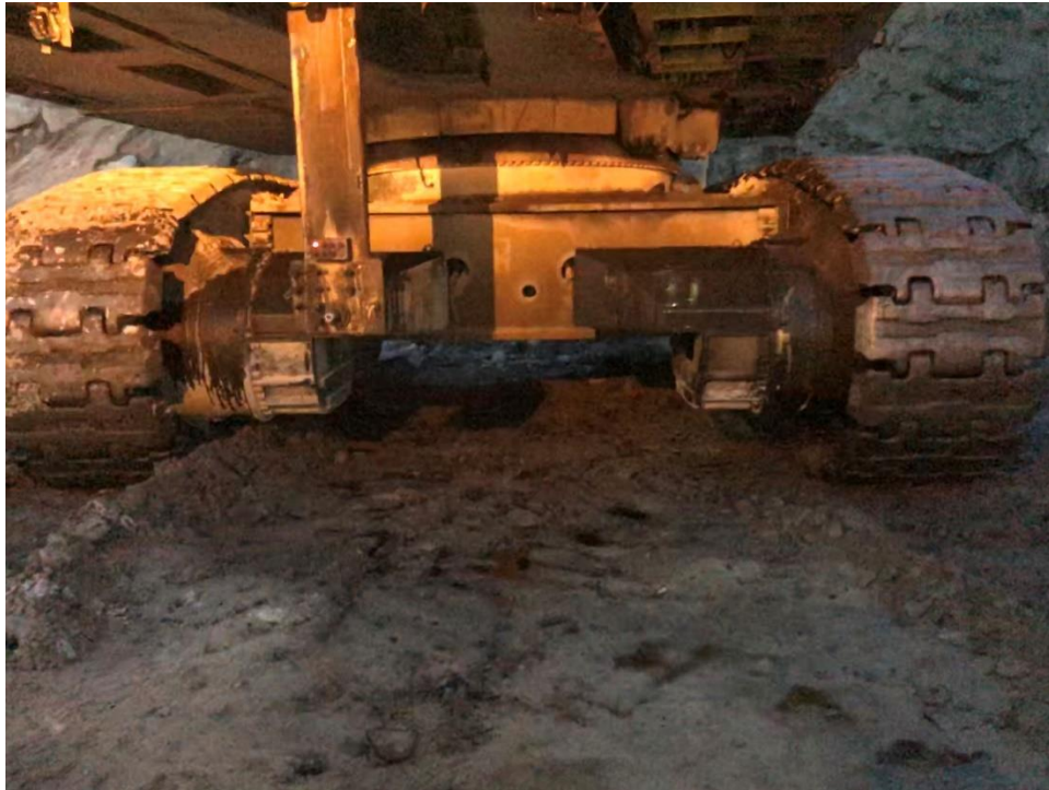
Photo showing the Hydraulic Oil Spill Location

A DIVISION OF DE BEERS CANADA INC. SUITE 300, 5102 – 50 th AVENUE, YELLOWKNIFE, NT X1A 3S8 TEL: 1 (867) 766-7350 FAX: 1 (867) 766-7351 www.debeerscanada.com