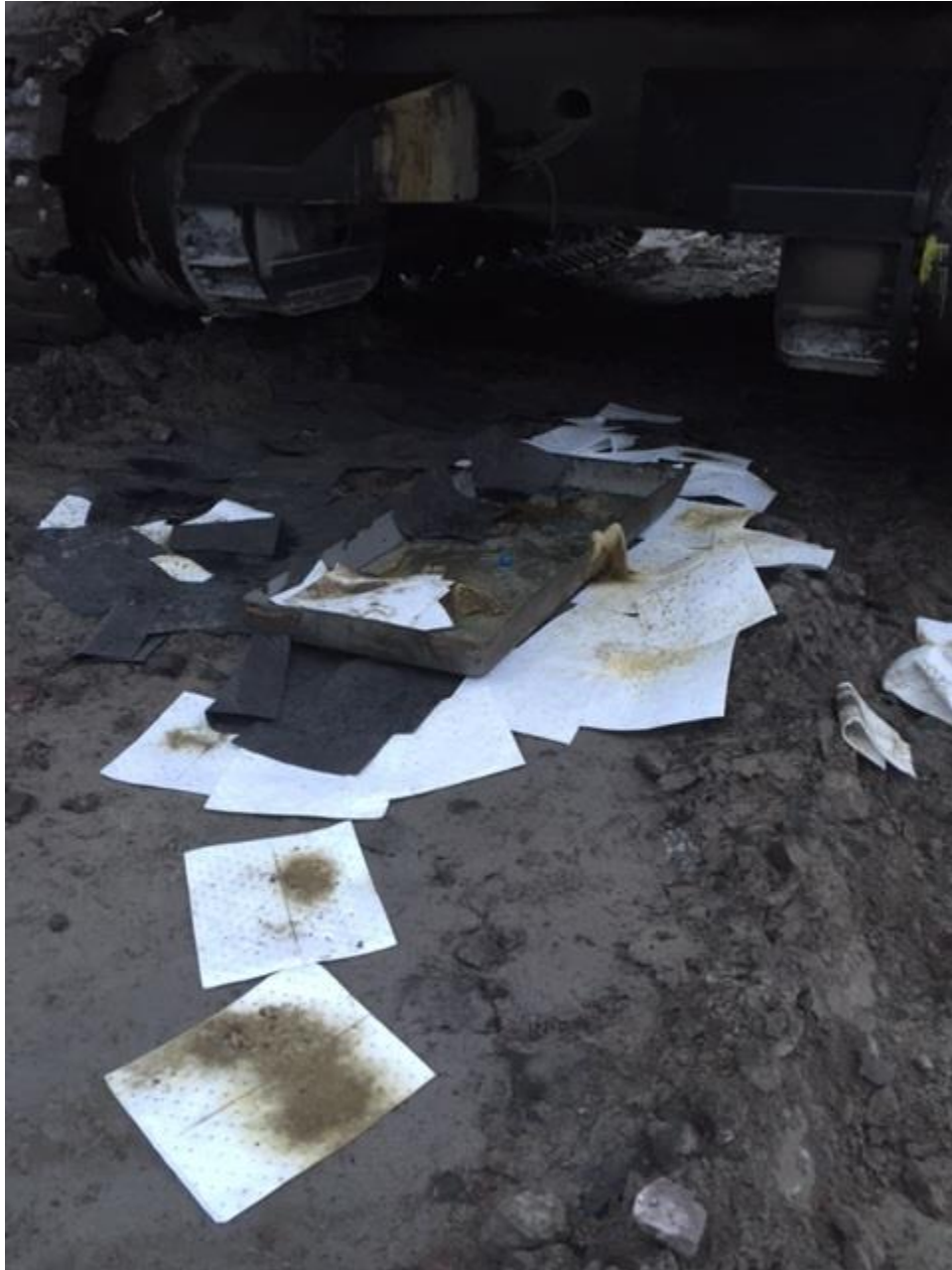
Initial Clean Up using Spill Pads

A DIVISION OF DE BEERS CANADA INC. SUITE 300, 5102 – 50 th AVENUE, YELLOWKNIFE, NT X1A 3S8 TEL: 1 (867) 766-7350 FAX: 1 (867) 766-7351 www.debeerscanada.com