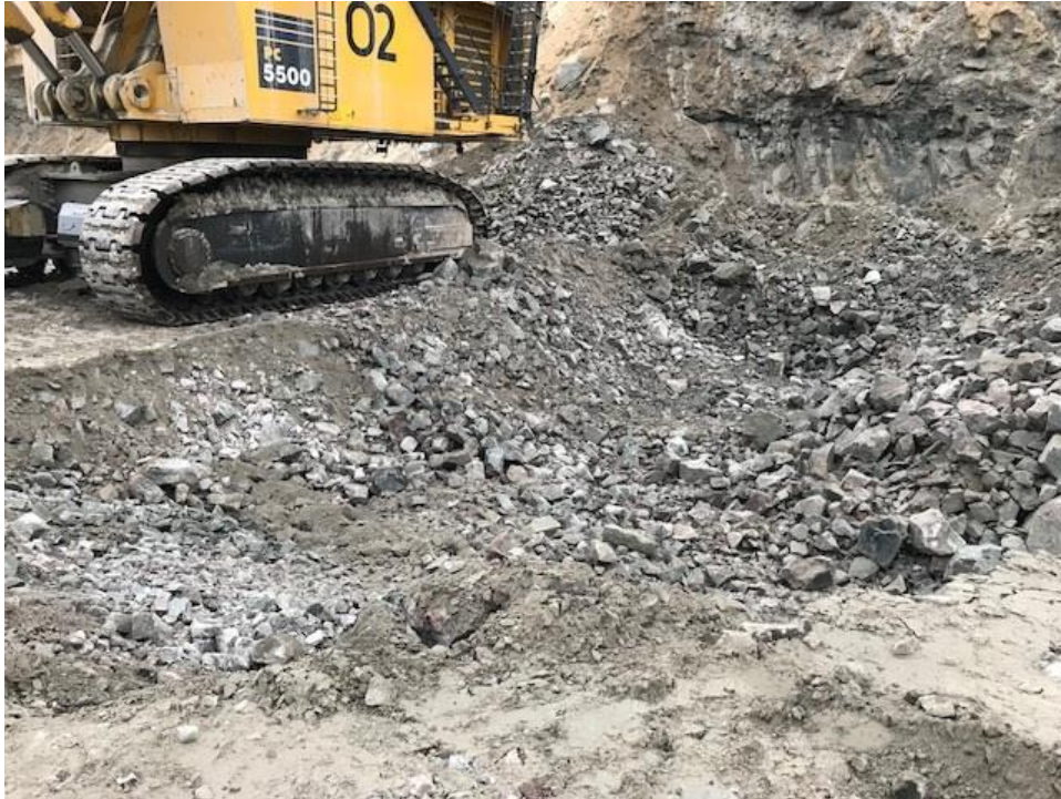
Area of excavated contaminated material disposed of in the Type 3 Area of the South Mine Rock Pile

A DIVISION OF DE BEERS CANADA INC. SUITE 300, 5102 – 50 th AVENUE, YELLOWKNIFE, NT X1A 3S8 TEL: 1 (867) 766-7350 FAX: 1 (867) 766-7351 www.debeerscanada.com