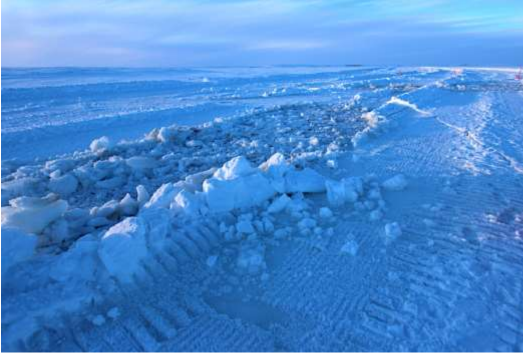
After vehicle retrieval