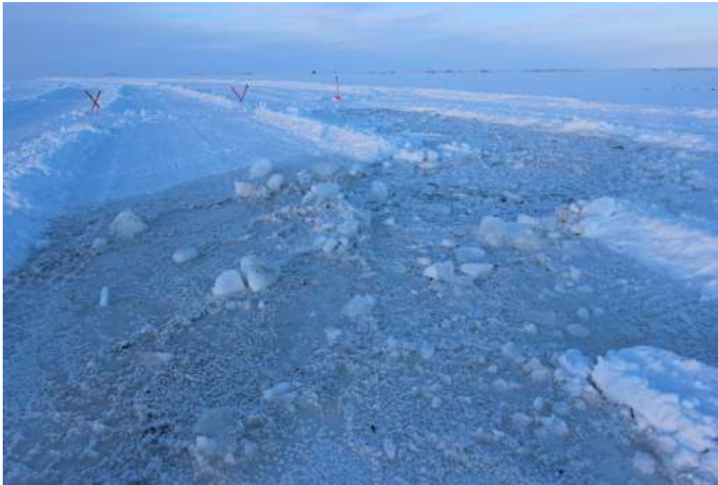
After vehicle retrieval