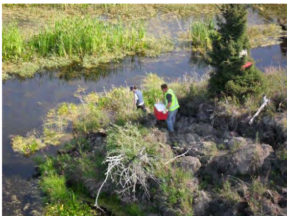
Path to Sampling Location