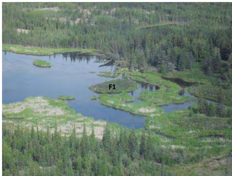
Aerial View of F1 Site