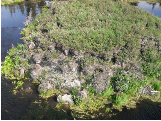
Aerial View of SNP 0032-F1