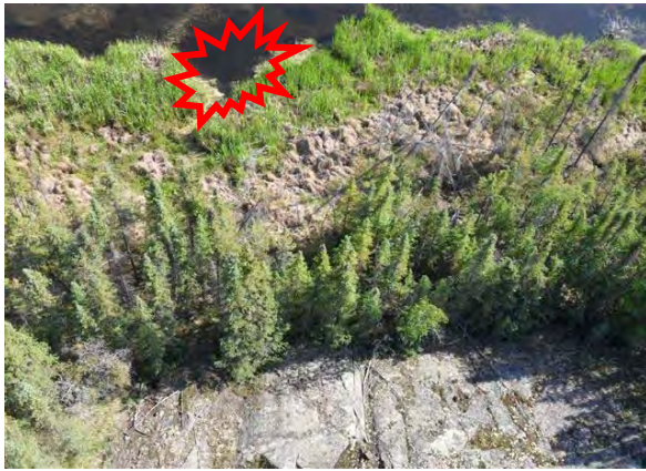
Proposed Sampling Location