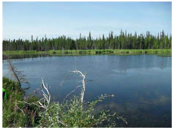
View From Proposed Sampling Location