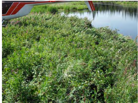
Tall Grasses at Site