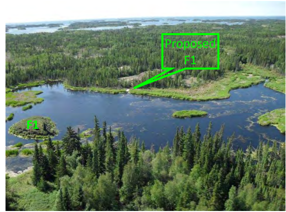
Views of Proposed and Existing F1 Sites