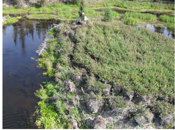
Cracks in Island