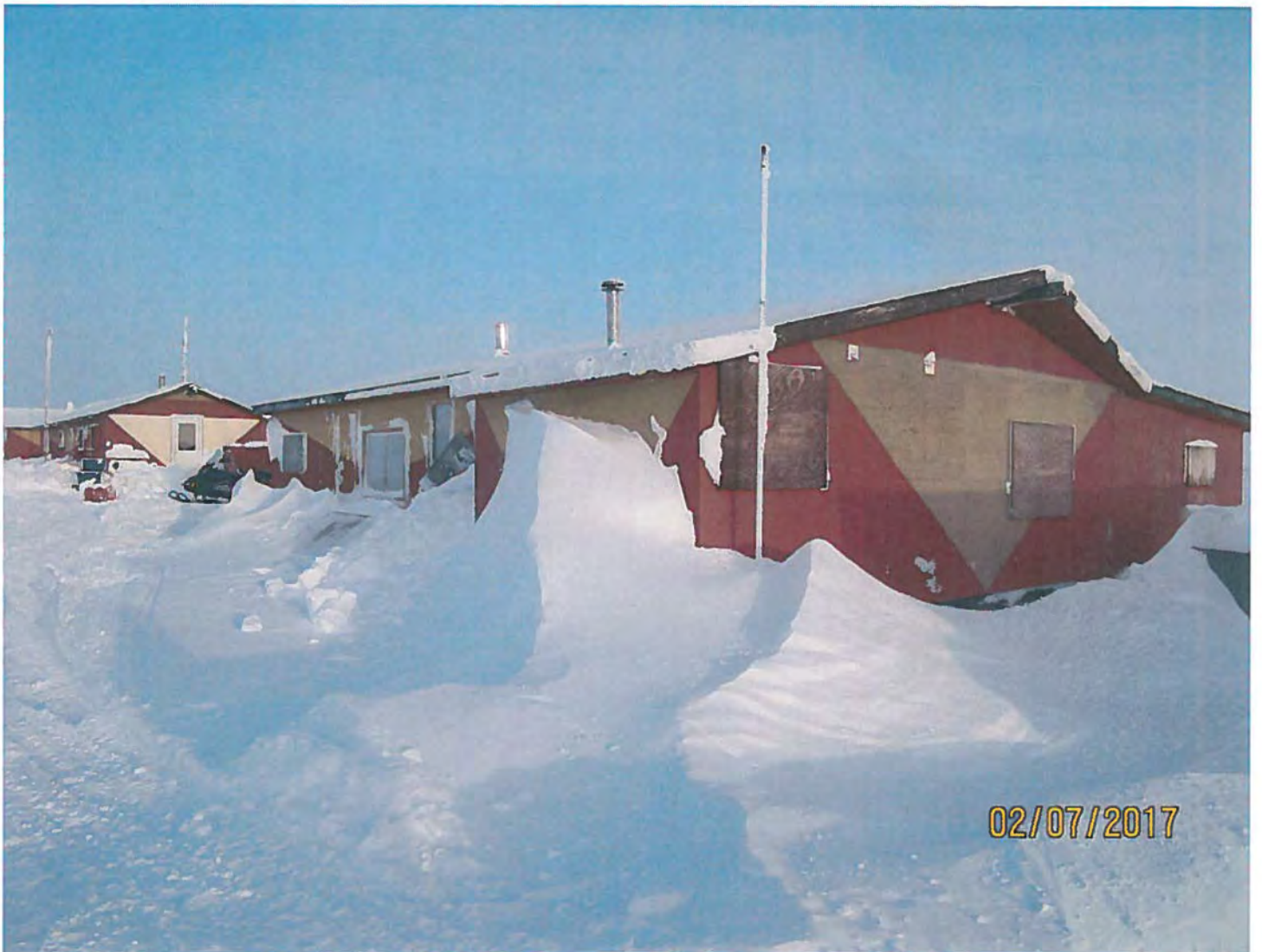
Photo #1 - MV2013J0006 True North Safaris Ltd. Two of the active buildings at Mackay Lake Lodge.