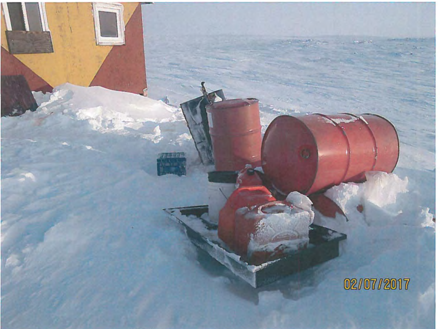
Photo #4 - MV2013J0006 True North Safaris Ltd. Fuel drums appeared to be properly stored and active fuel containers were in secondary containment.