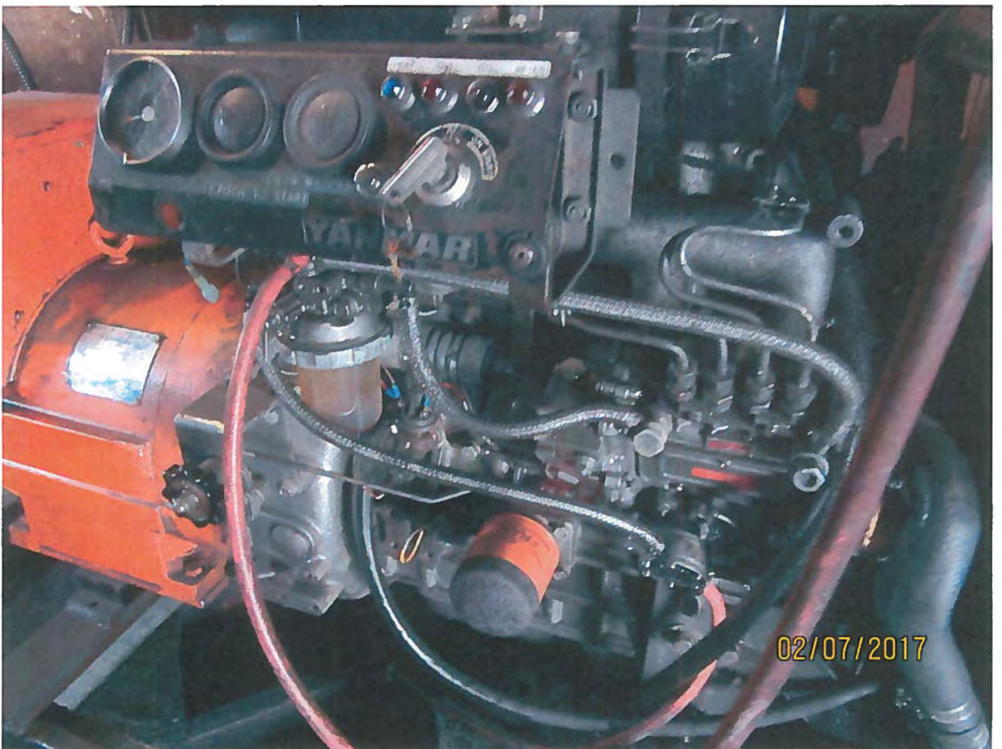
Photo #2 - MV2013J0006 True North Safaris Ltd. Fuel was leaking from the fuel filter of the camp generator.