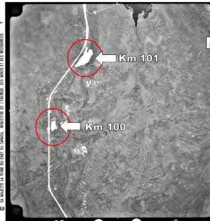
Figure 1 - Aerial Photo A27028-97 taken on August 26, 1986 showing pit developments at Km 100 and 101 Highway No. 1.

Rowe's Construction has had active land use permits at the Km 100 quarry since 2001 to current date. The Km 100 quarry is located outside of Deh Cho First Nations Interim Measure Agreement withdrawn lands.