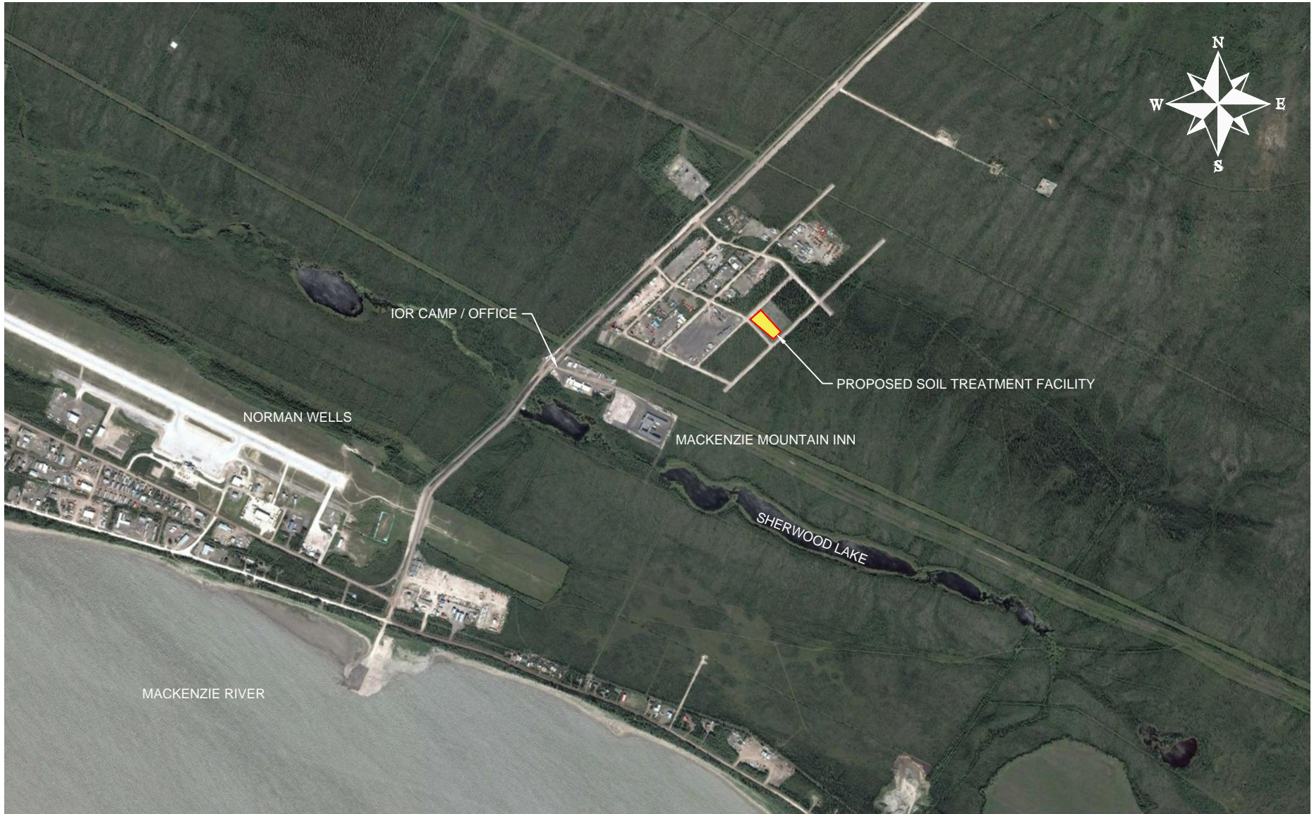
2016 SATELLITE AERIAL PHOTO