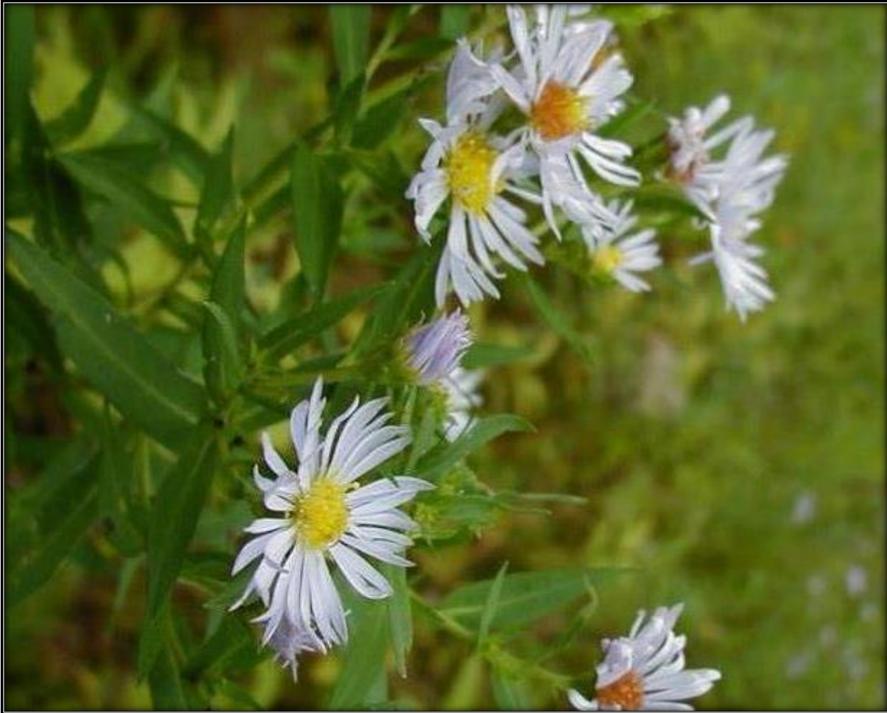
Photo 1: Nahanni Aster flowers- note the central yellow disc surrounded by white to pale pink rays.