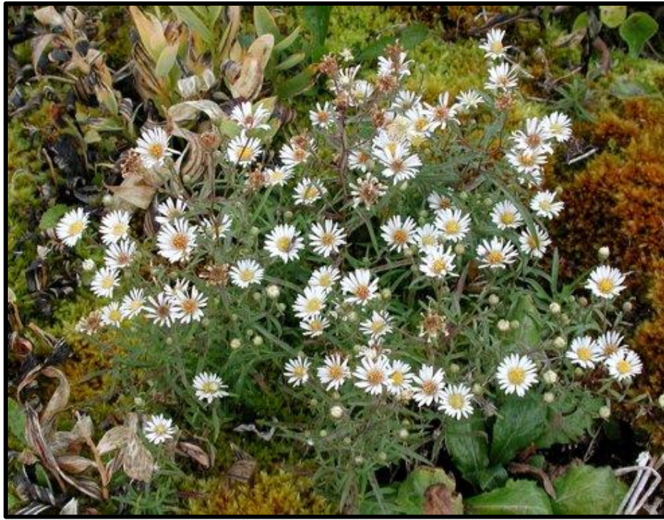
Photo 2: Nahanni Aster plant- Note the multiple stems from a single plant and multiple flower heads per stem. Shown in typical location on Sphagnum Moss.

Current Range: The Nahanni Aster is only known from Hot springs within Nahanni National Park.