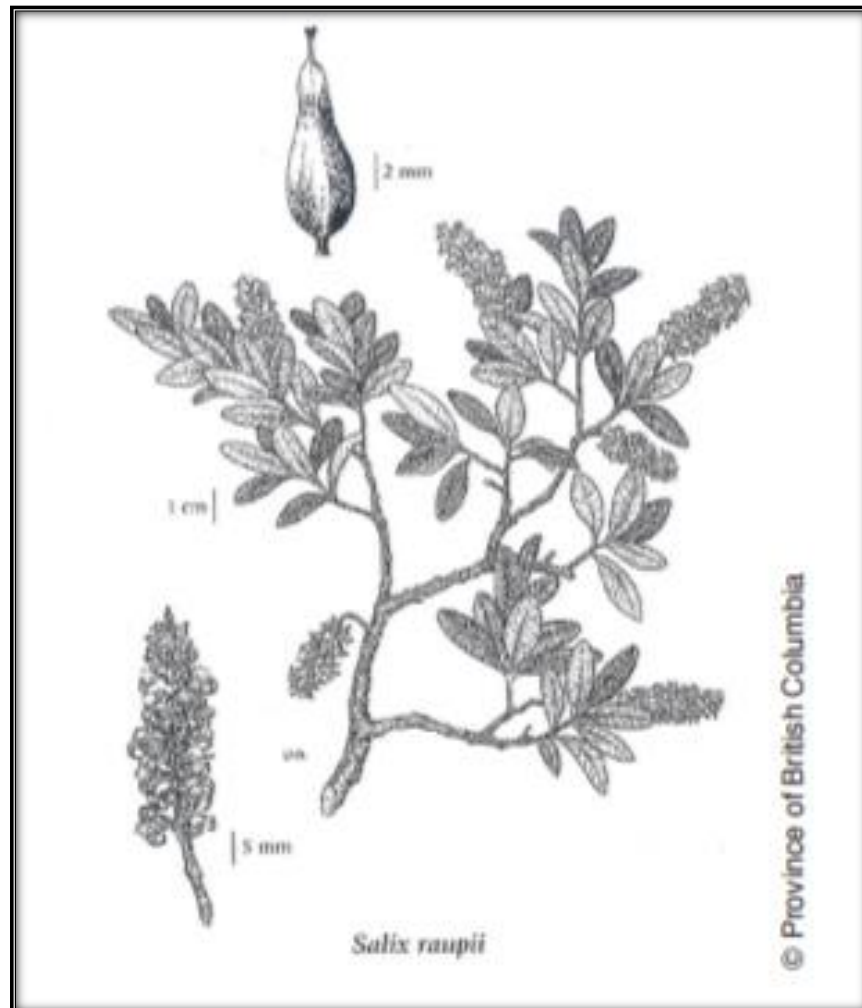
Photo 1: Raup's Willow illustrations. Note the typical leaf, seed, fruit and flower shape and sizes.