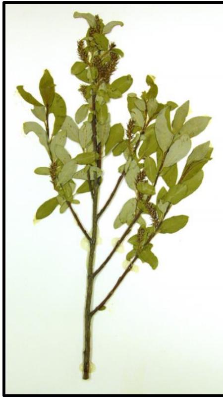
Photo 2: Raup's Willow- Note the leaf shape and distinctive yellow coloring.

Current Range: The Raup's Willow is only known the southwestern NWT