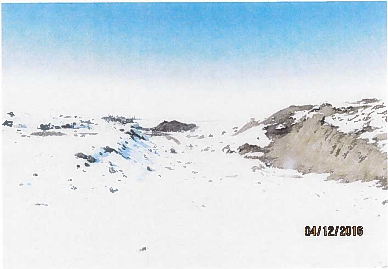
Another view of the stock pile