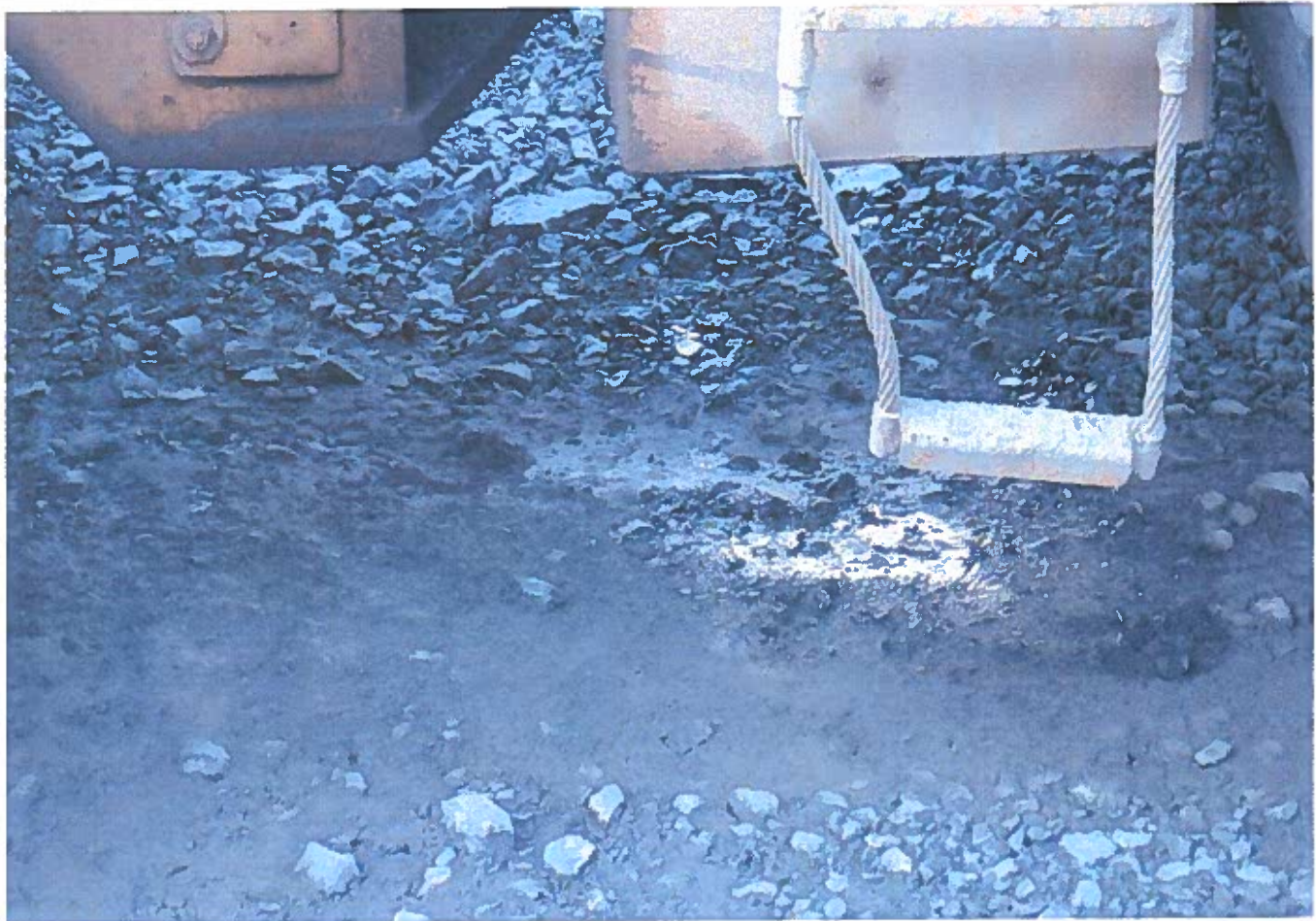
Figure 2 The loader with the spill under it