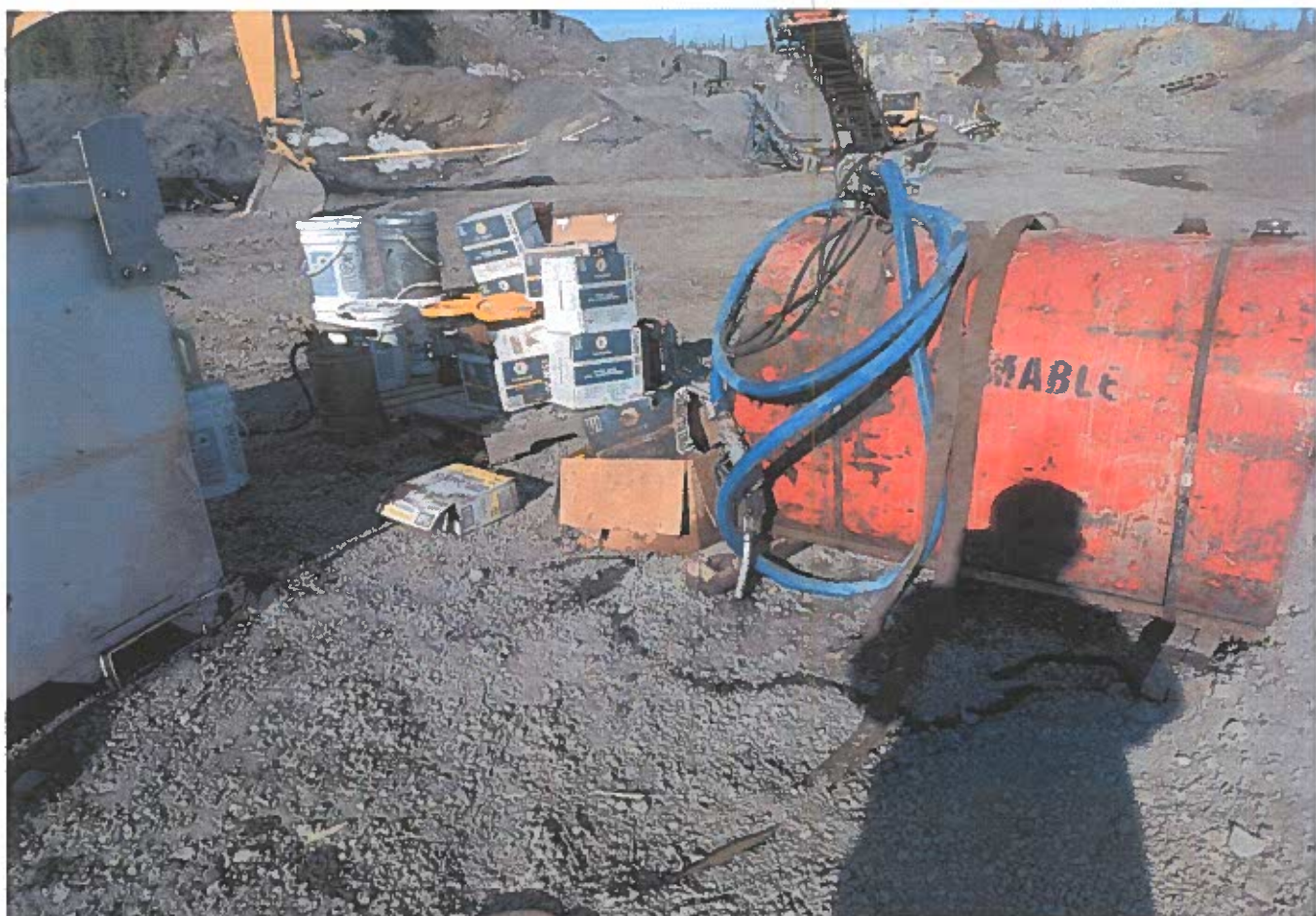
rags used oil