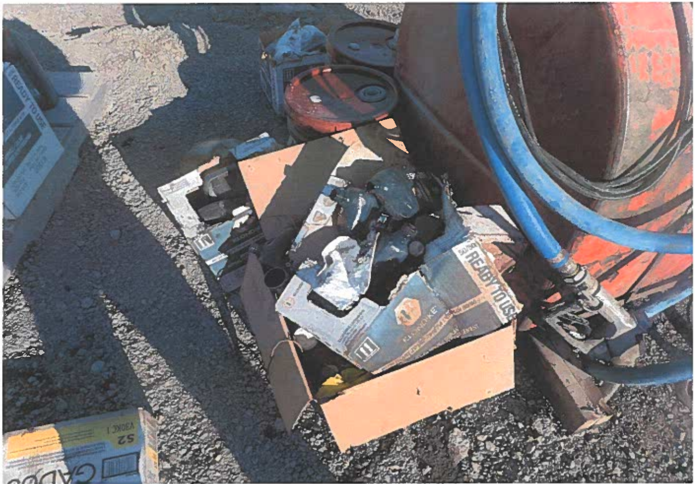
Figure 4 rag on tank