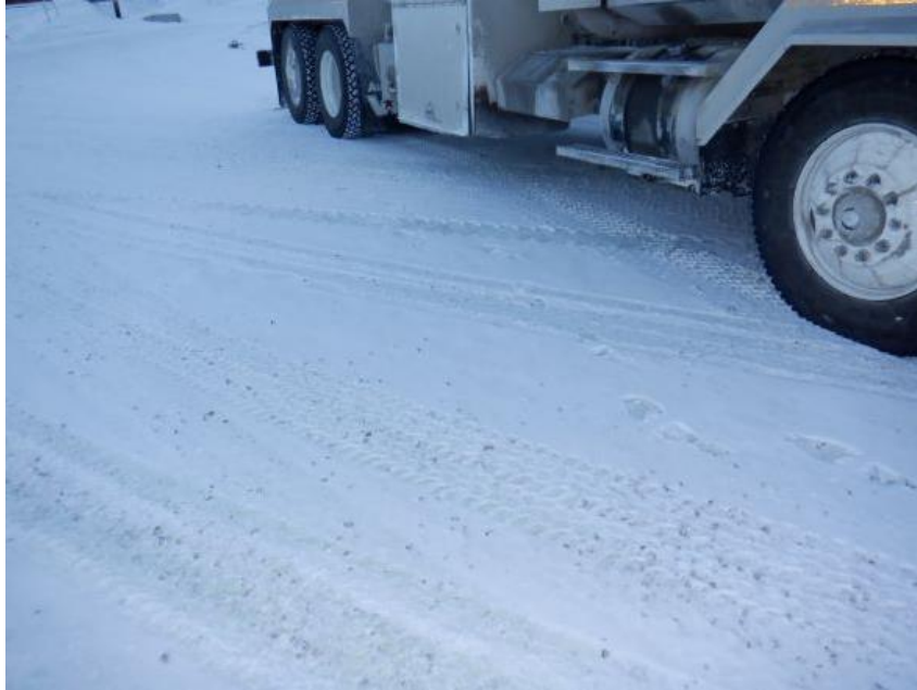
Figure 4. Clean Up Photos GNWT Spill #2021484