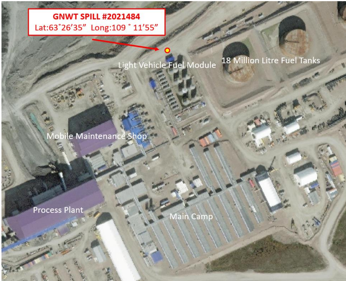
Figure 1. Location of GNWT Spill #2021484