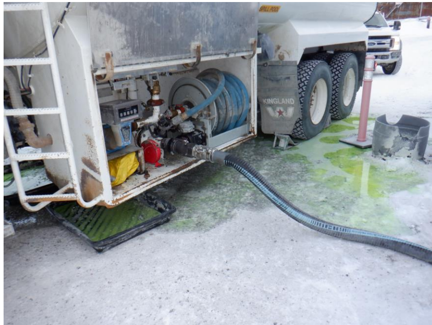
Figure 3. Photos GNWT Spill #2021484