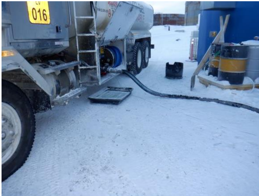
Figure 5. Clean Up Photos GNWT Spill #2021484