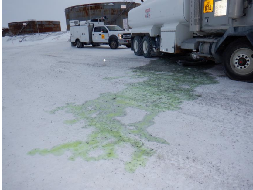
Figure 2. Photos GNWT Spill #2021484