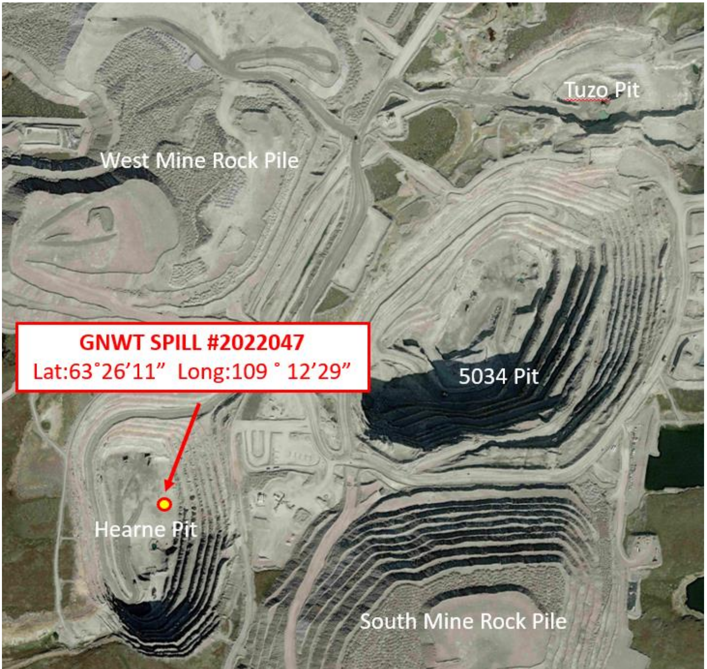
Figure 1. Location of GNWT Spill #2022047