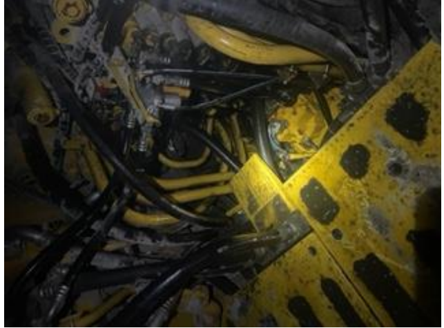
Figure 2. Photos GNWT Spill #2022047