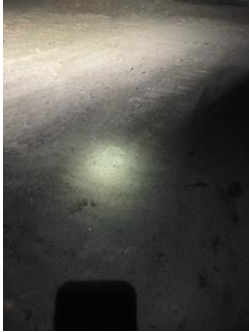
Figure 3. Clean Up Photos GNWT Spill #2022047