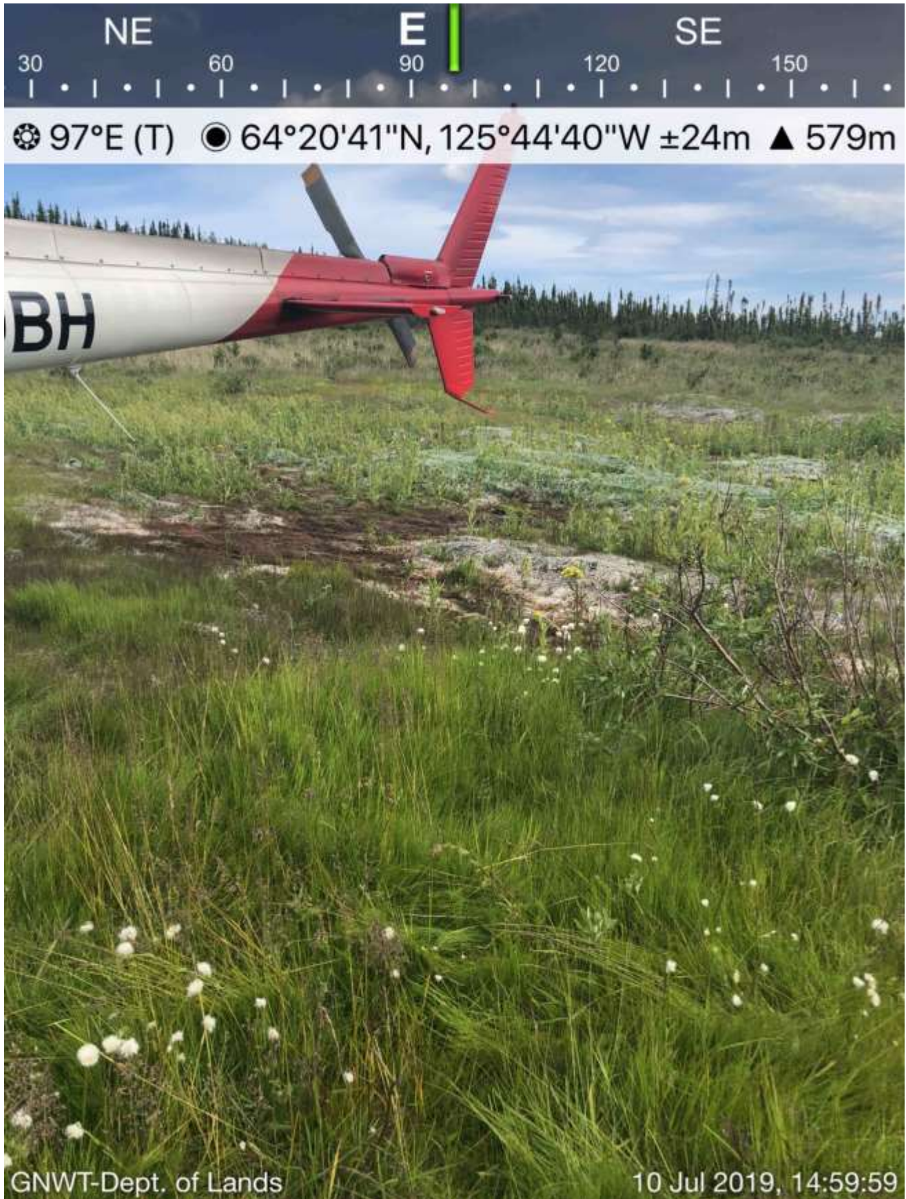
Figure 3 Westside of the Phytoremediated spill area.