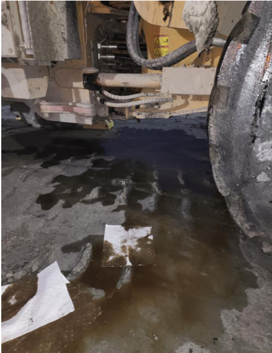
Figure 2 Extent of spill onto crusher ROM