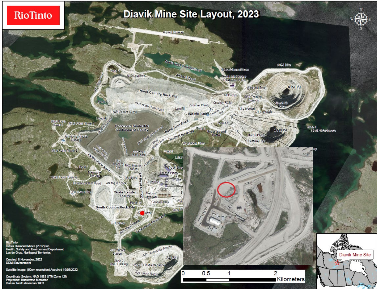
Figure 1 A21 West Ramp load out area temporary kimberlite ore storage location