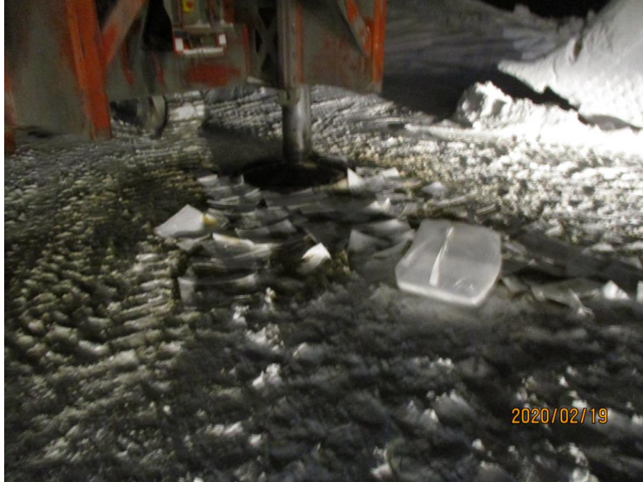
Figure 3. Spill 2020053 after clean up