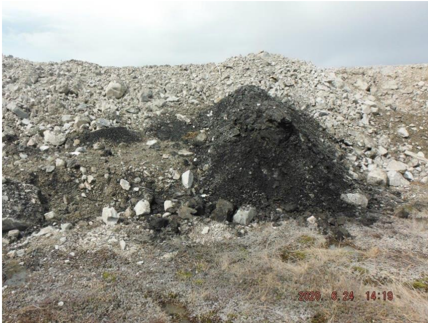
Figure 3. Spill 2020192 after clean-up