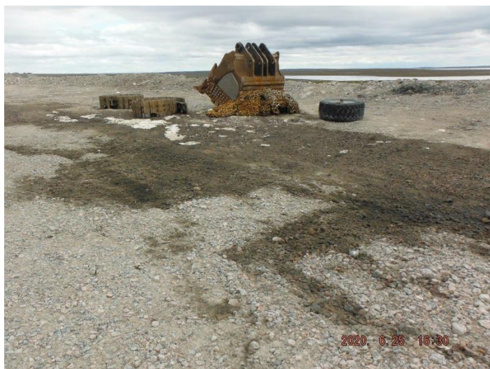
Figure 3. Spill 2020195 after clean-up