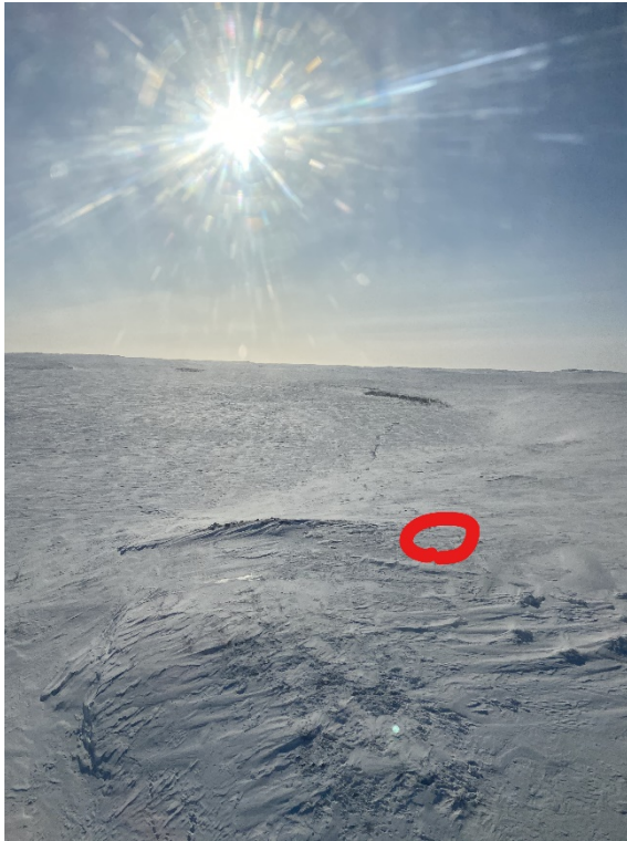
Figure 1: Left picture is bird's eye view of A537 site (red circle)