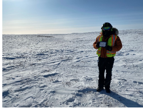
Figure 2: Above picture taken from ground of A537 site.

Should you have any questions or concerns, please do not hesitate to be in touch.