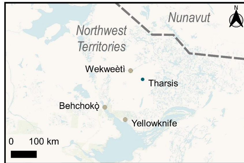
Figure 1 Location of the Tharsis Property.