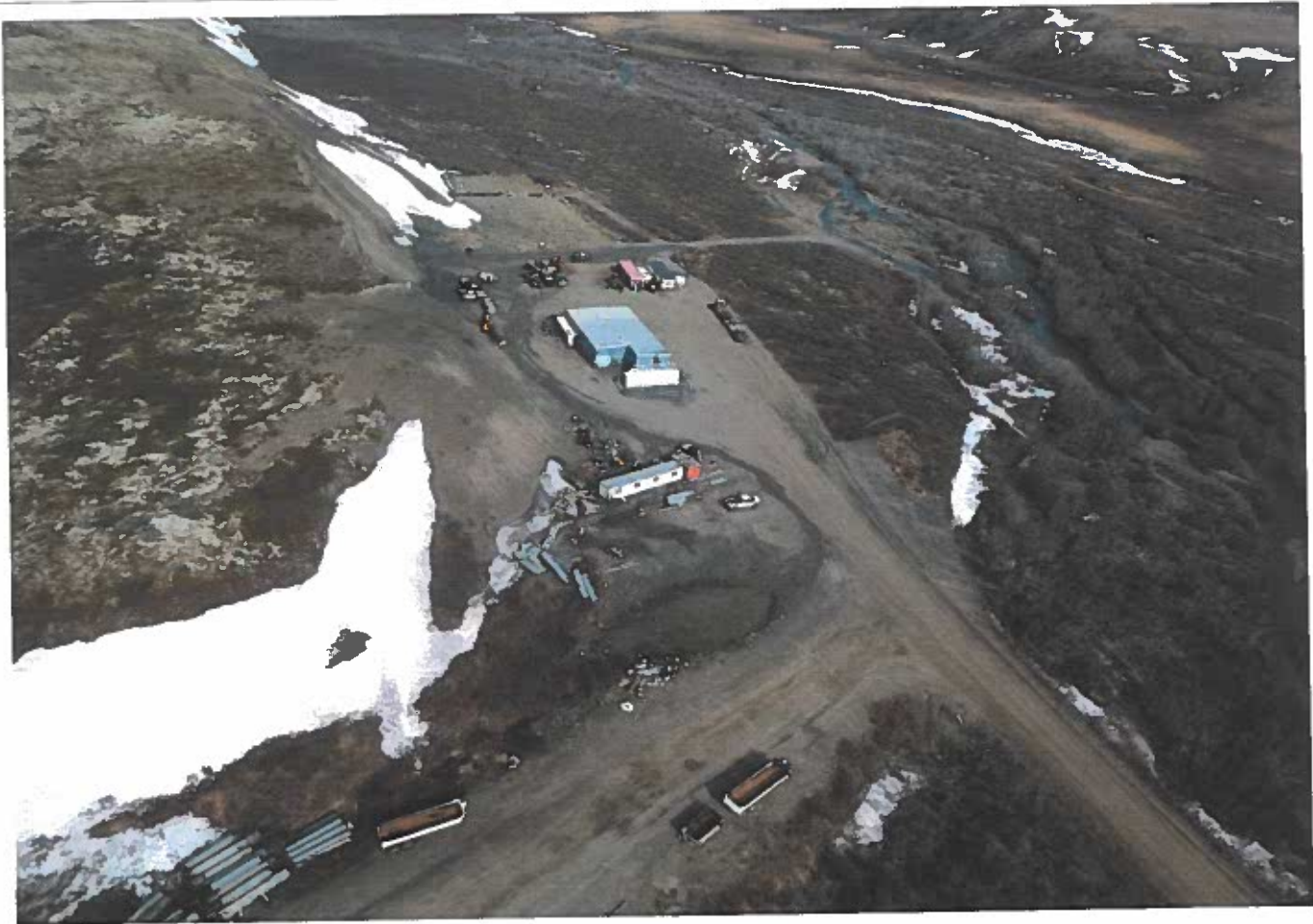
Figure 3 Aerial view of the maintenance camp site.