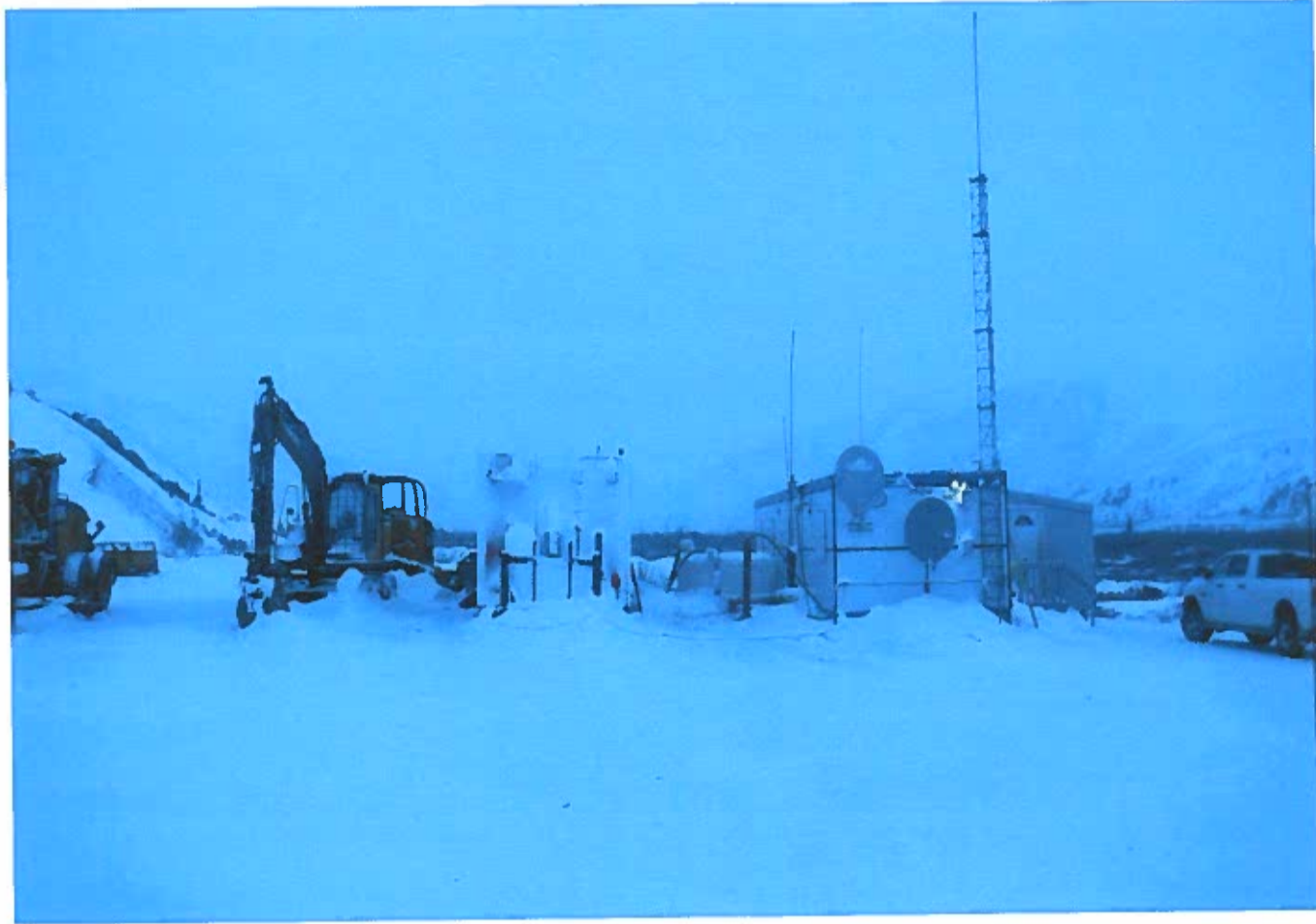
Figure 6 The camps and some of the equipment.