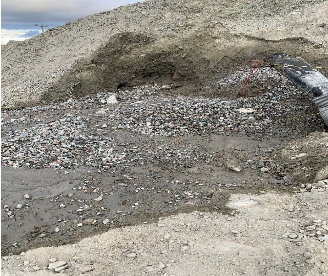
Figure 2 Broken pipeline and eroded berm inside containment