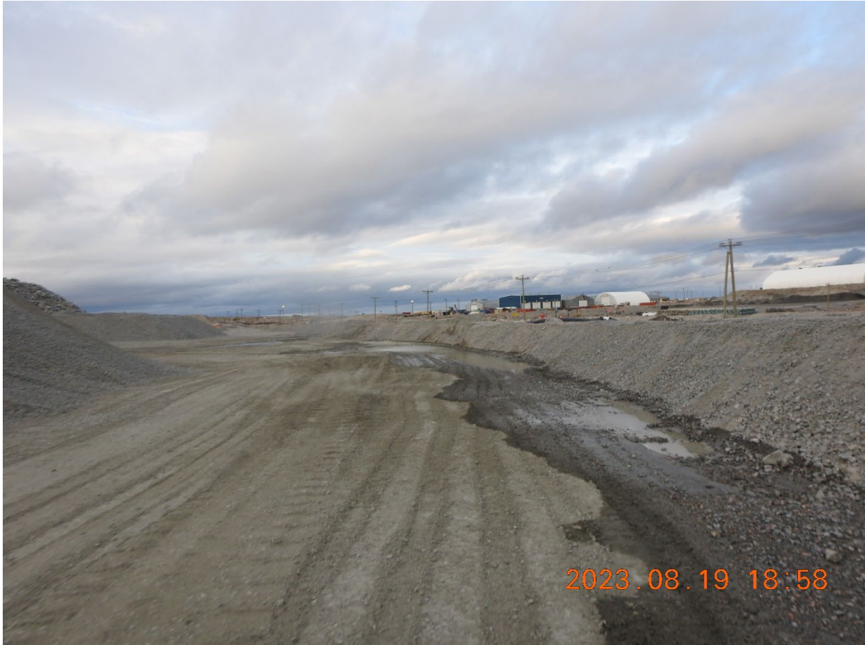
Figure 3 Spill contained inside Backfill Plant laydown