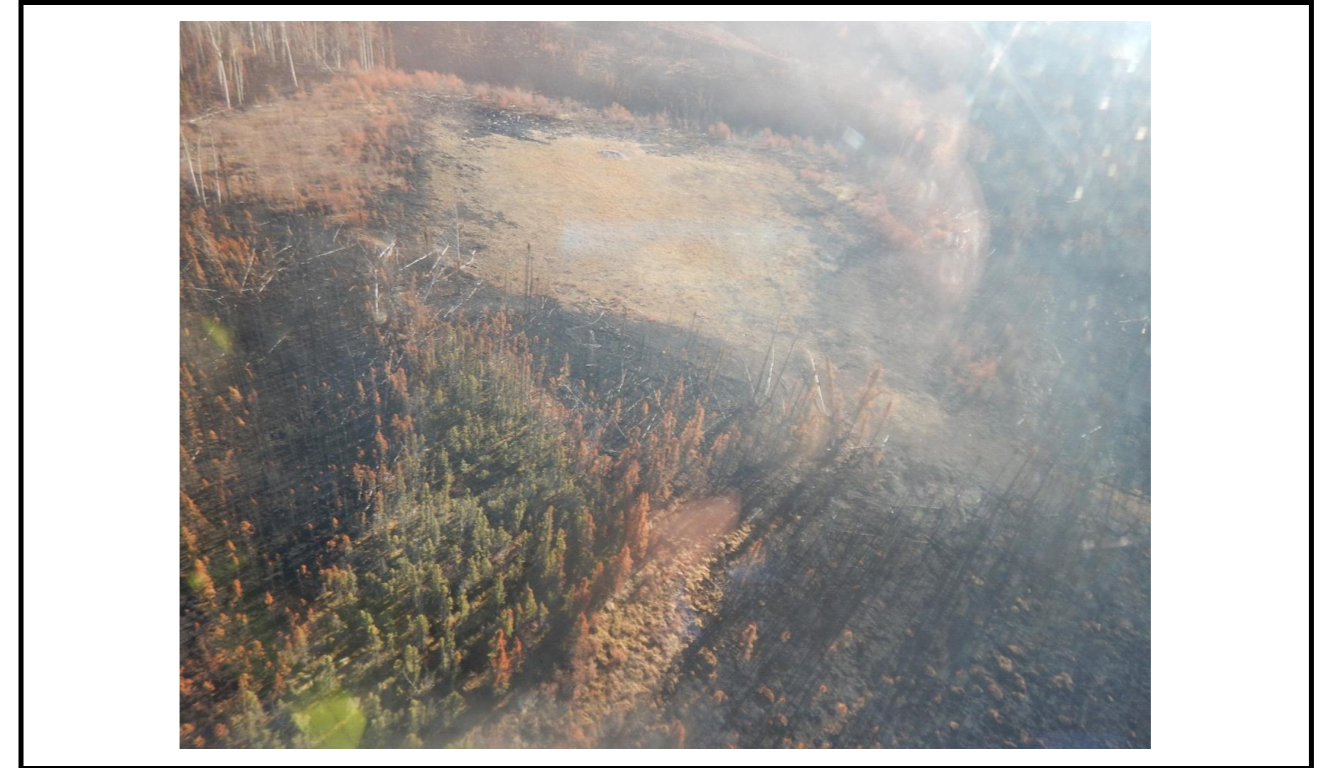
South view from helicopter