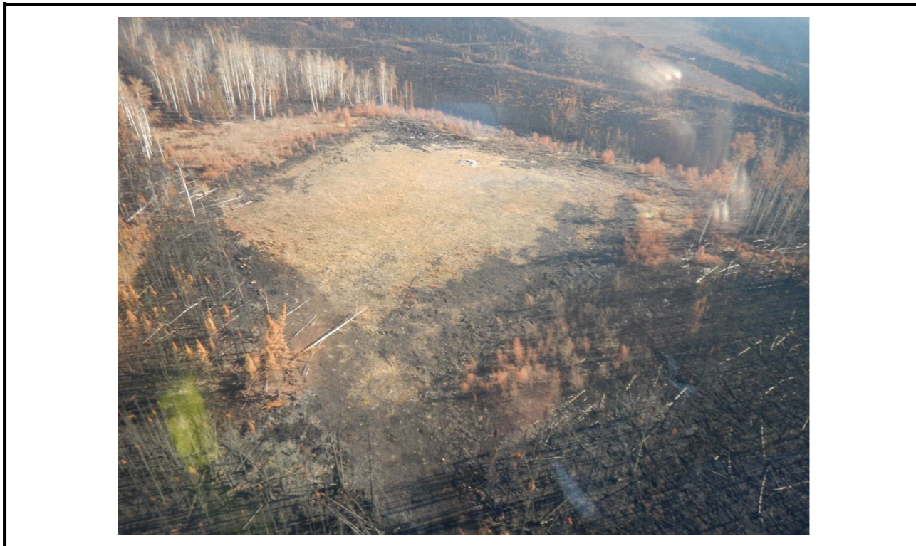
Southeast view from helicopter