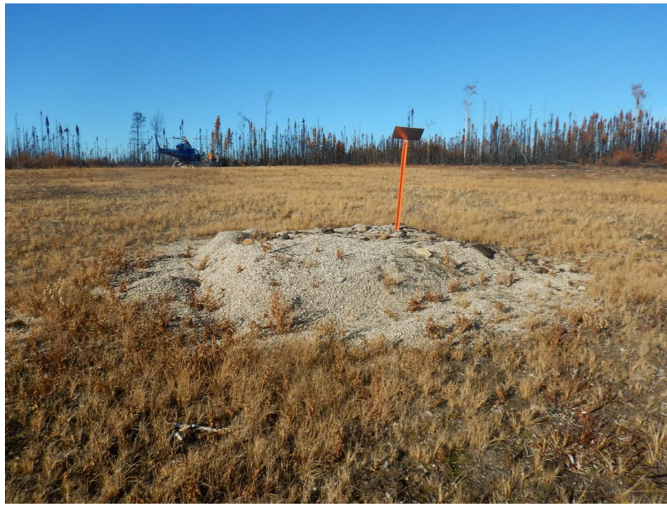
Looking North at well centre