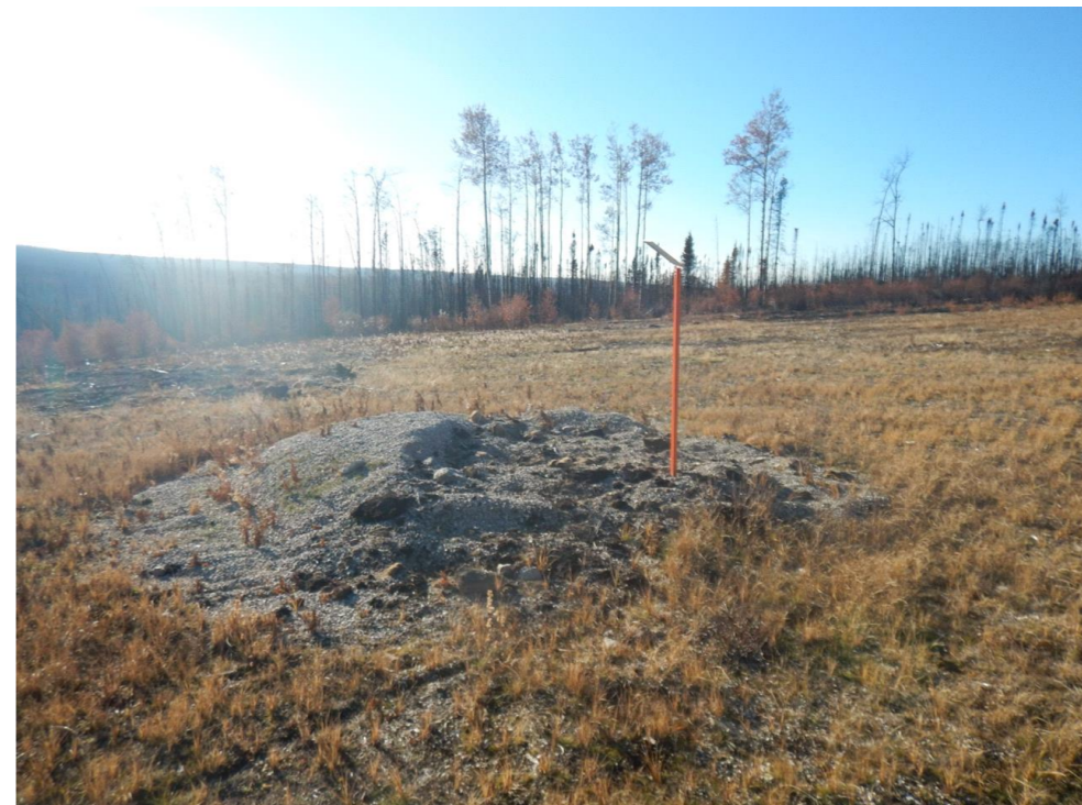
Looking west at well centre