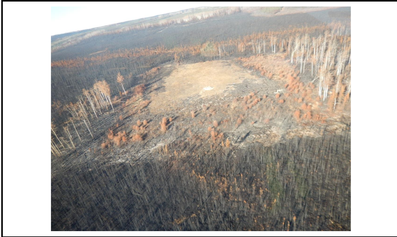
North view from Helicopter