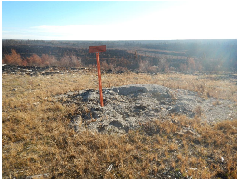
Looking south at well centre