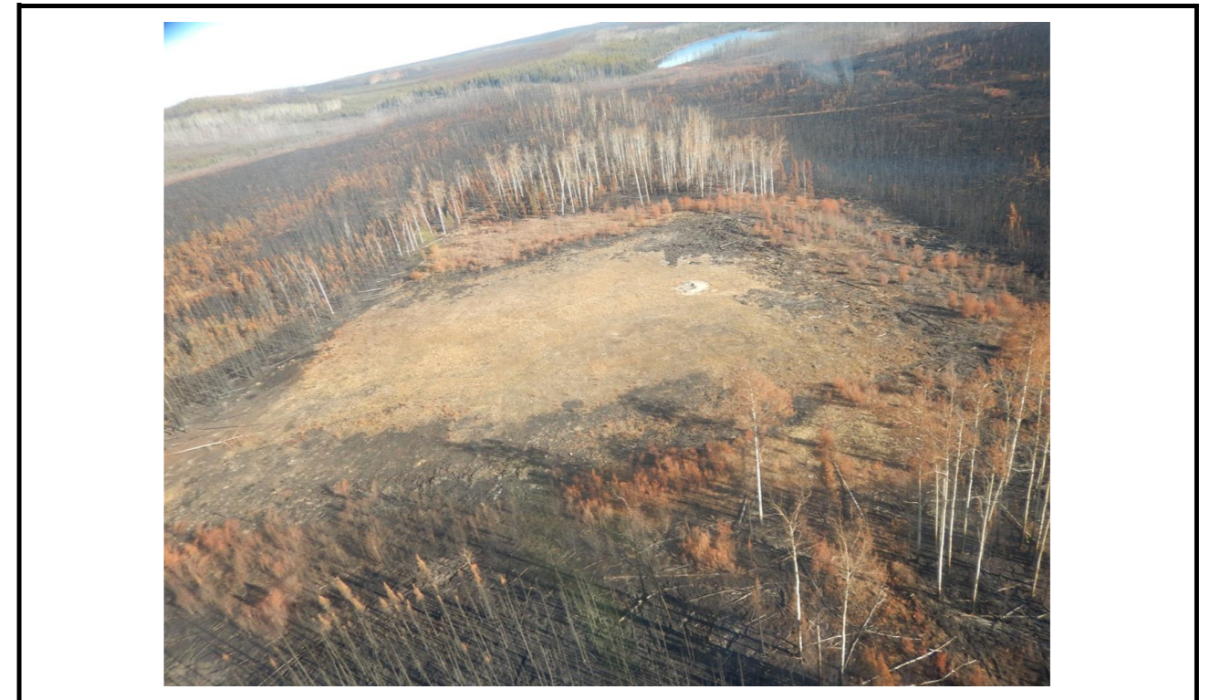
East view from helicopter