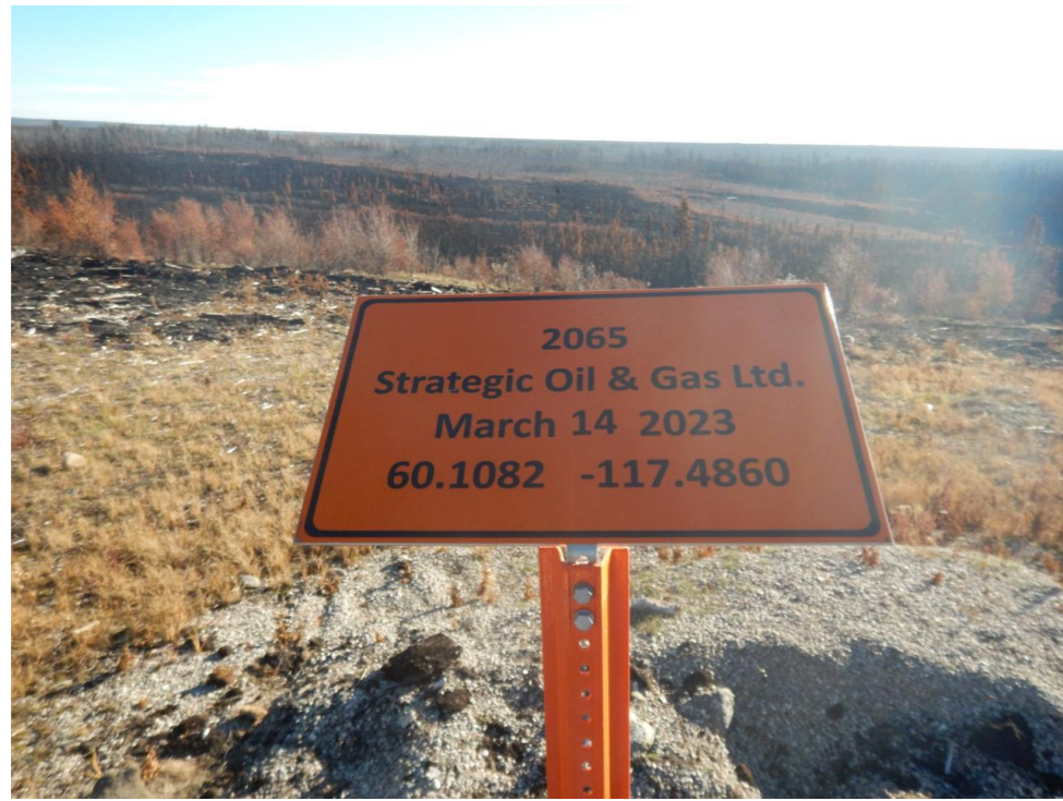
Abandoned well sign