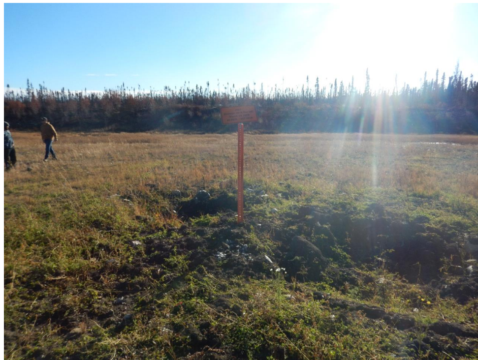
South at well centre