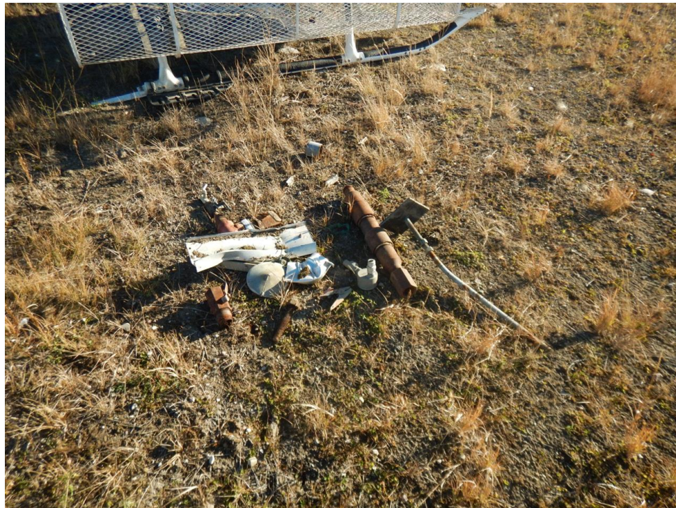
Debris removed from lease