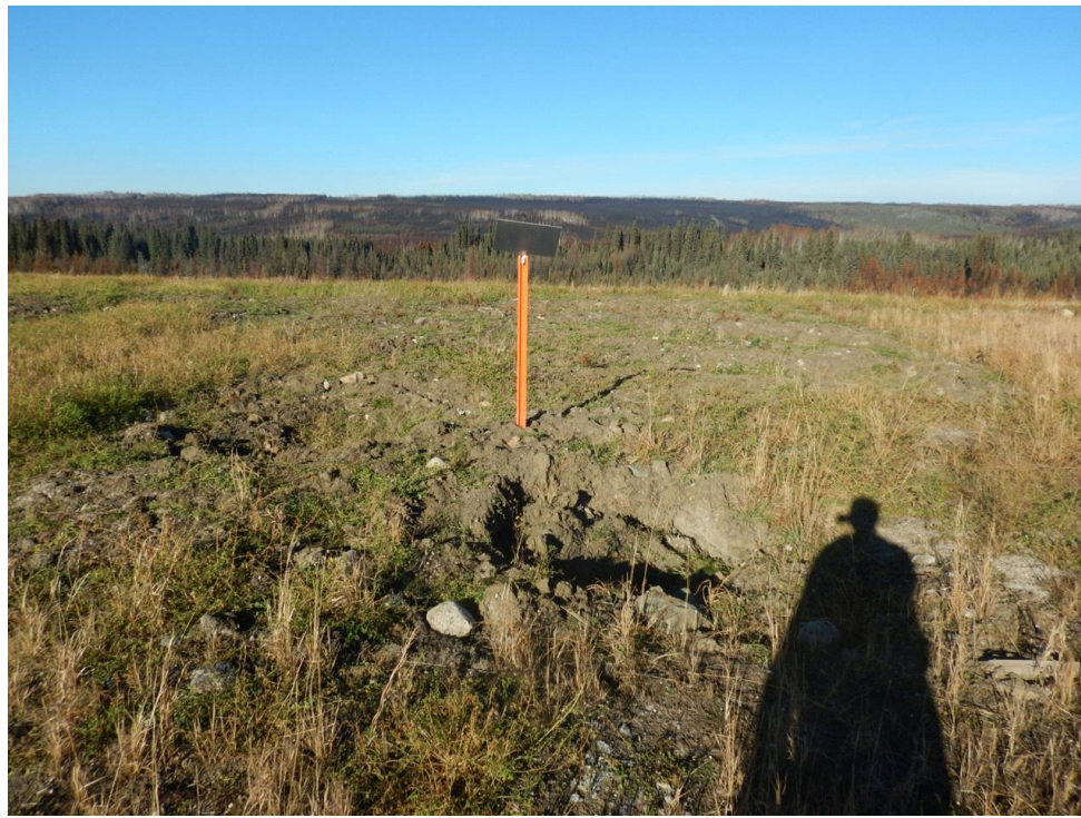
North at well centre