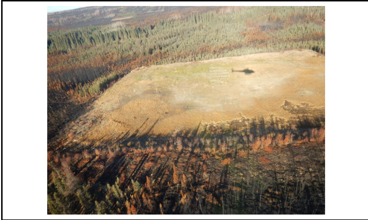
North view from Helicopter