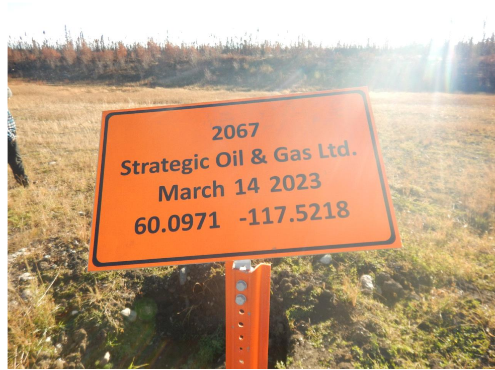
Abandoned well sign