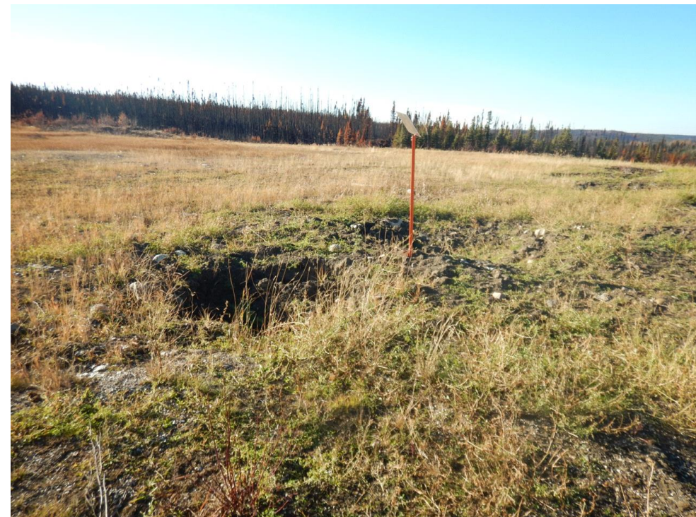
West at well centre