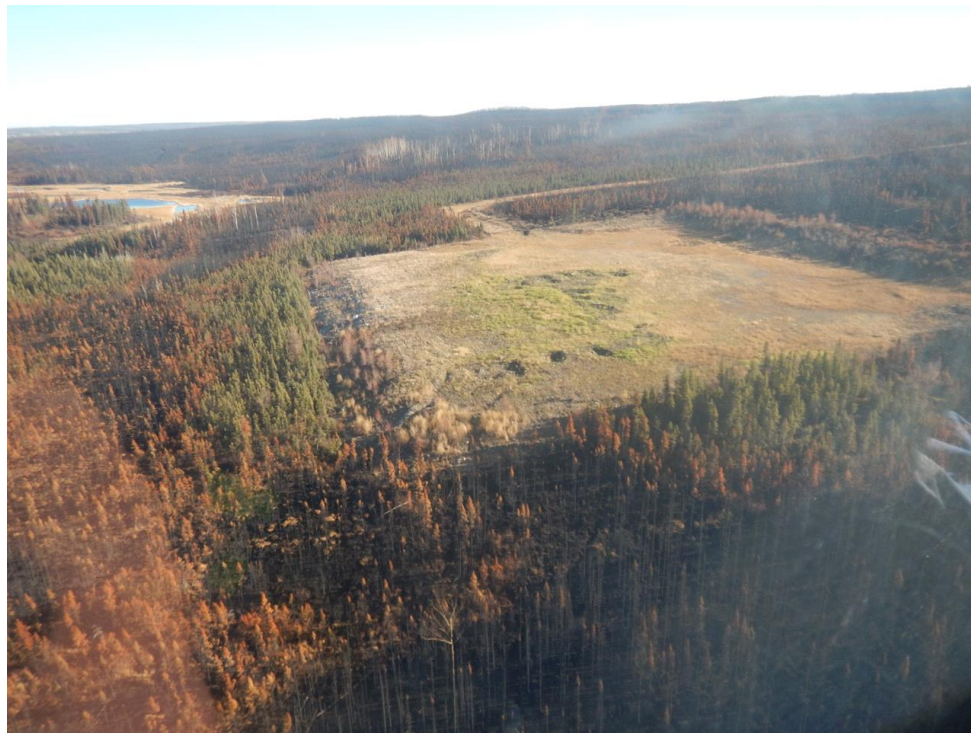
Southeast view from helicopter