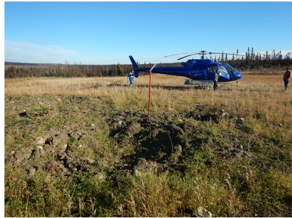
East at well centre