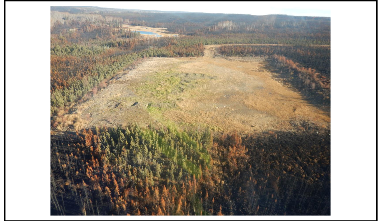
East view from helicopter