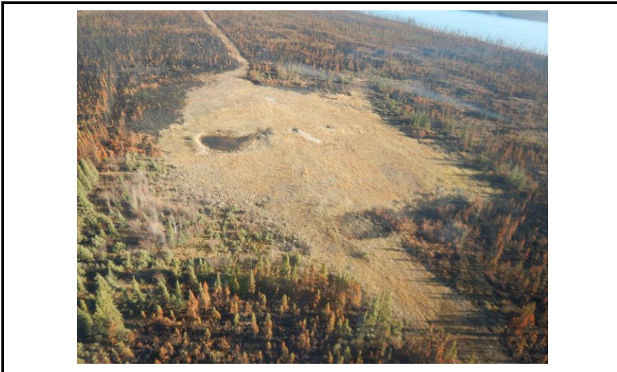
East view from helicopter