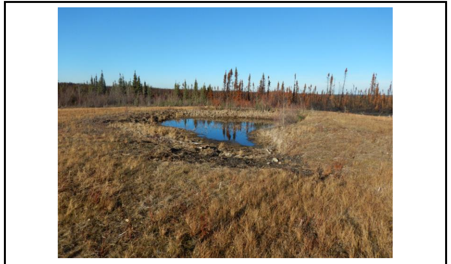
Potential pit / sump