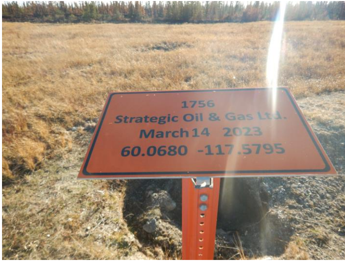
Abandoned well sign