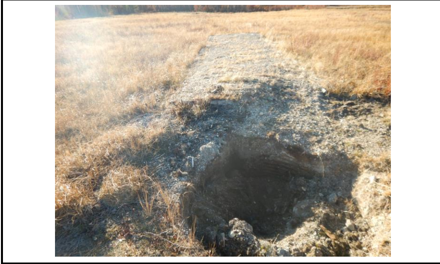
Gravel pumpjack pad and the subsidence at well centre