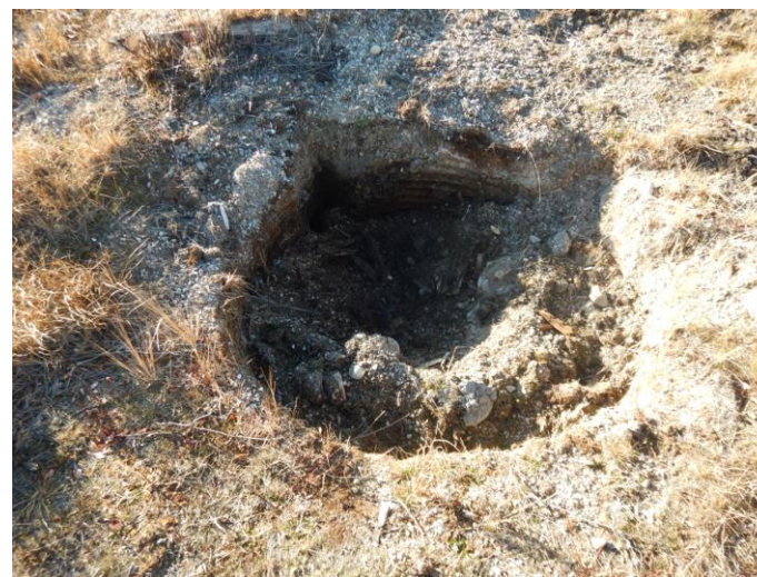
Subsidence at well centre, piece of caisson still stuck in ground