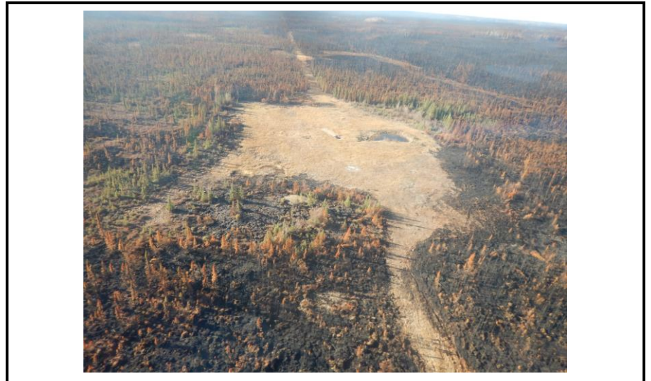
West view from helicopter