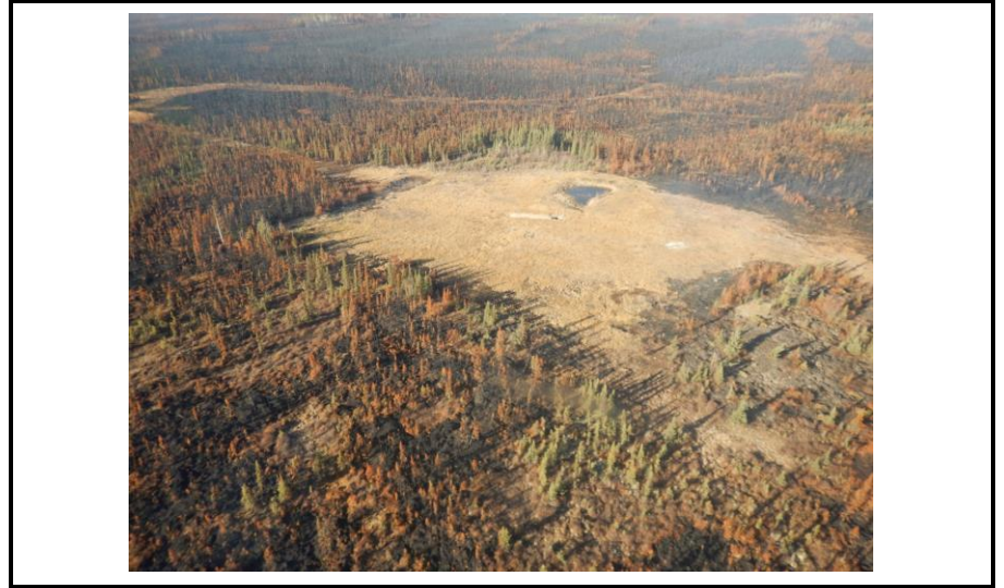
Northwest view from helicopter