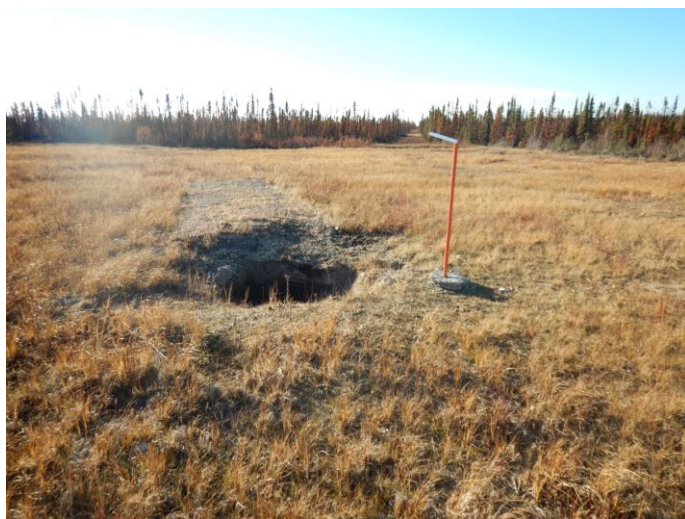
Looking west at well centre