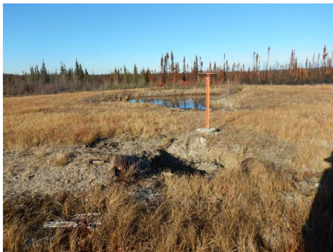
Looking North at well centre