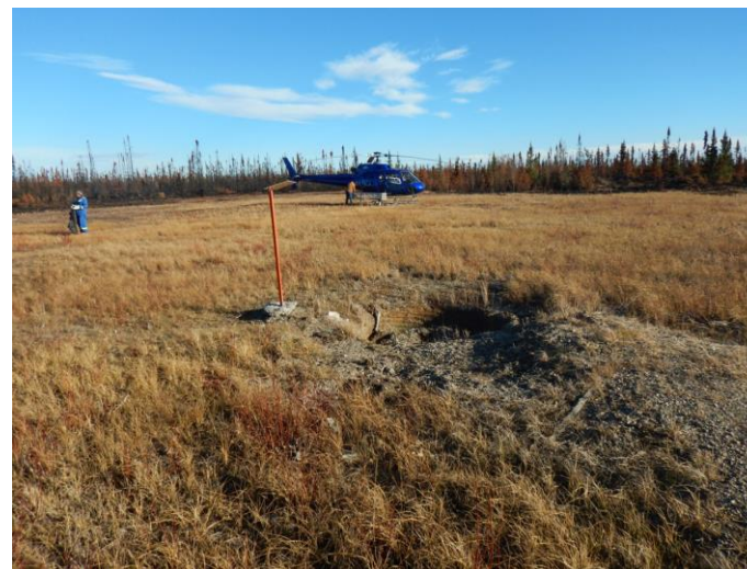
Looking east at well centre