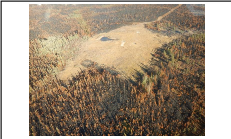
Northeast view from helicopter