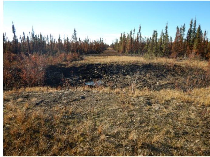
Burnt area on access road at lease entrance