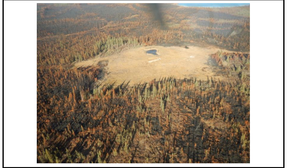
North view from helicopter