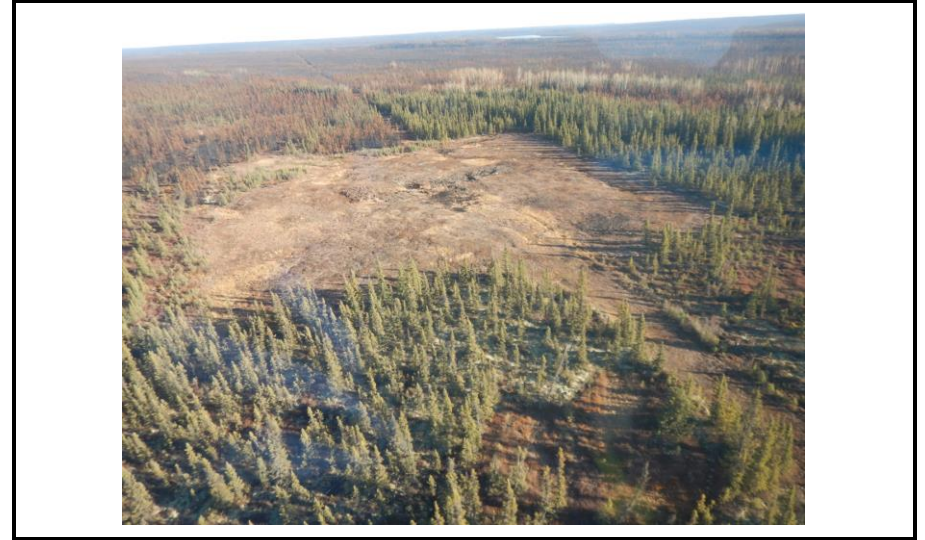
East view from helicopter