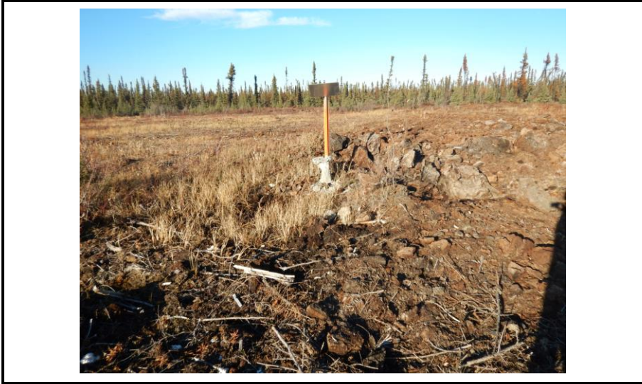
North at 2F-73 well centre