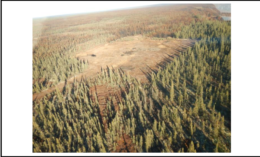
Northeast view from helicopter