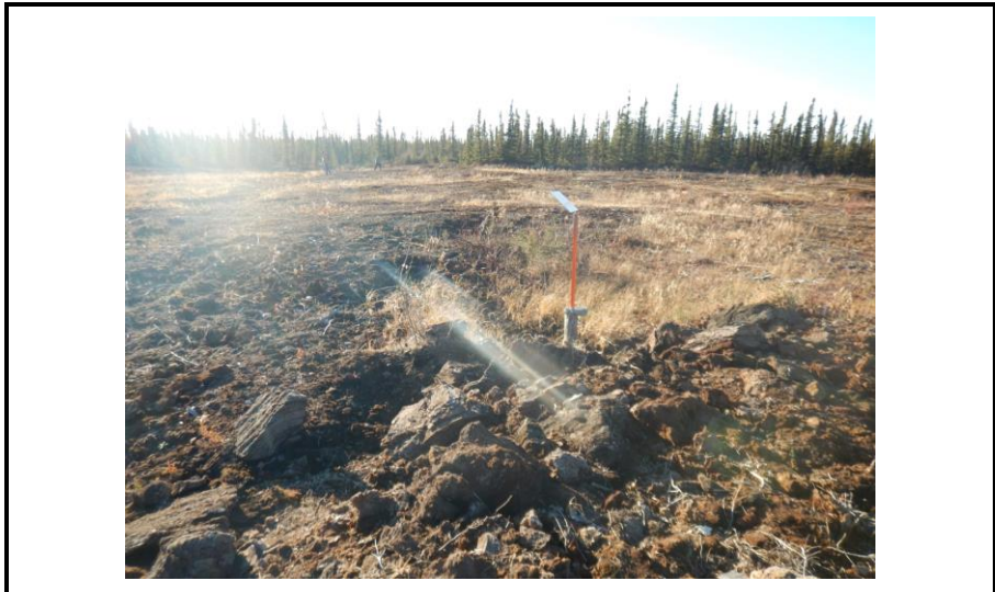
West at 2F-73 well centre