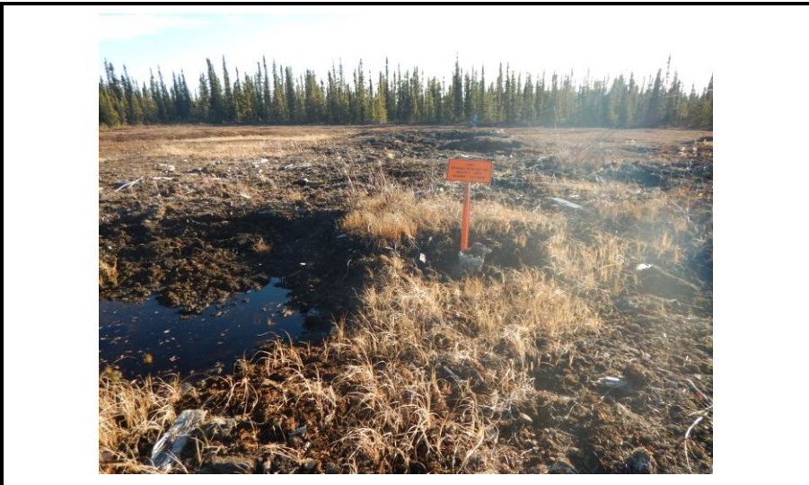
South at F-73 well centre