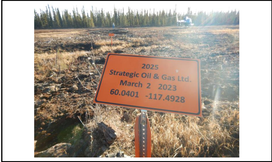
2F-73 Abandoned well sign