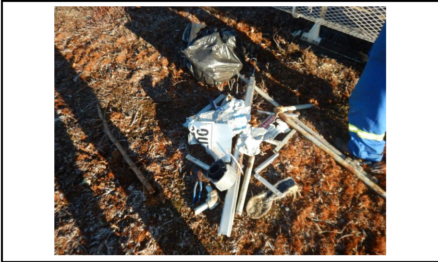
Garbage picked up off site