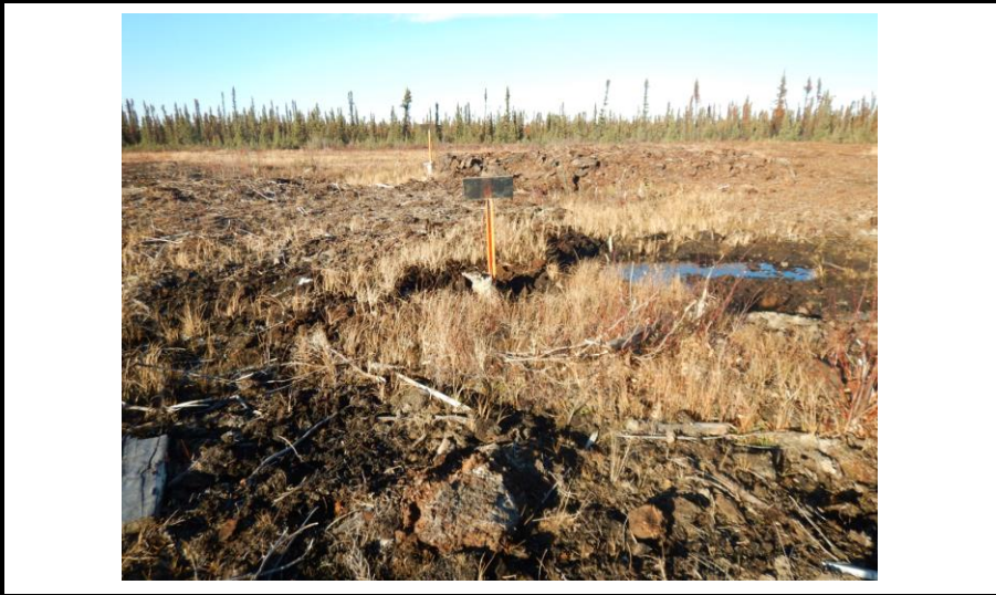
North at F-73 well centre