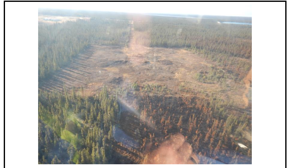
West view from helicopter