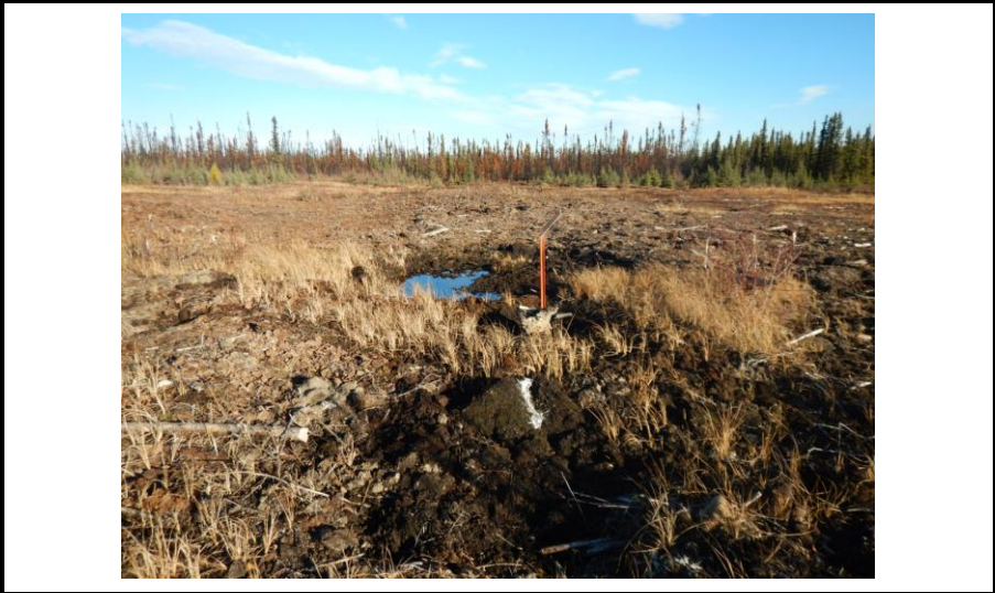
East at F-73 well centre