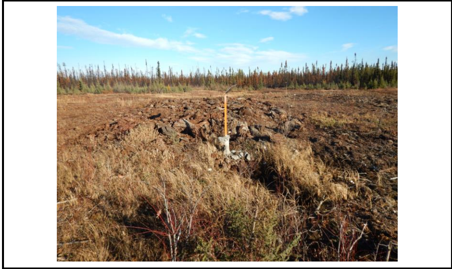
East at 2F-73 well centre