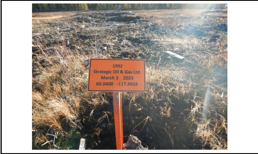
F-73 Abandoned well sign