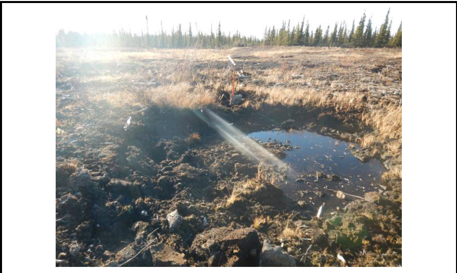
West at F-73 well centre