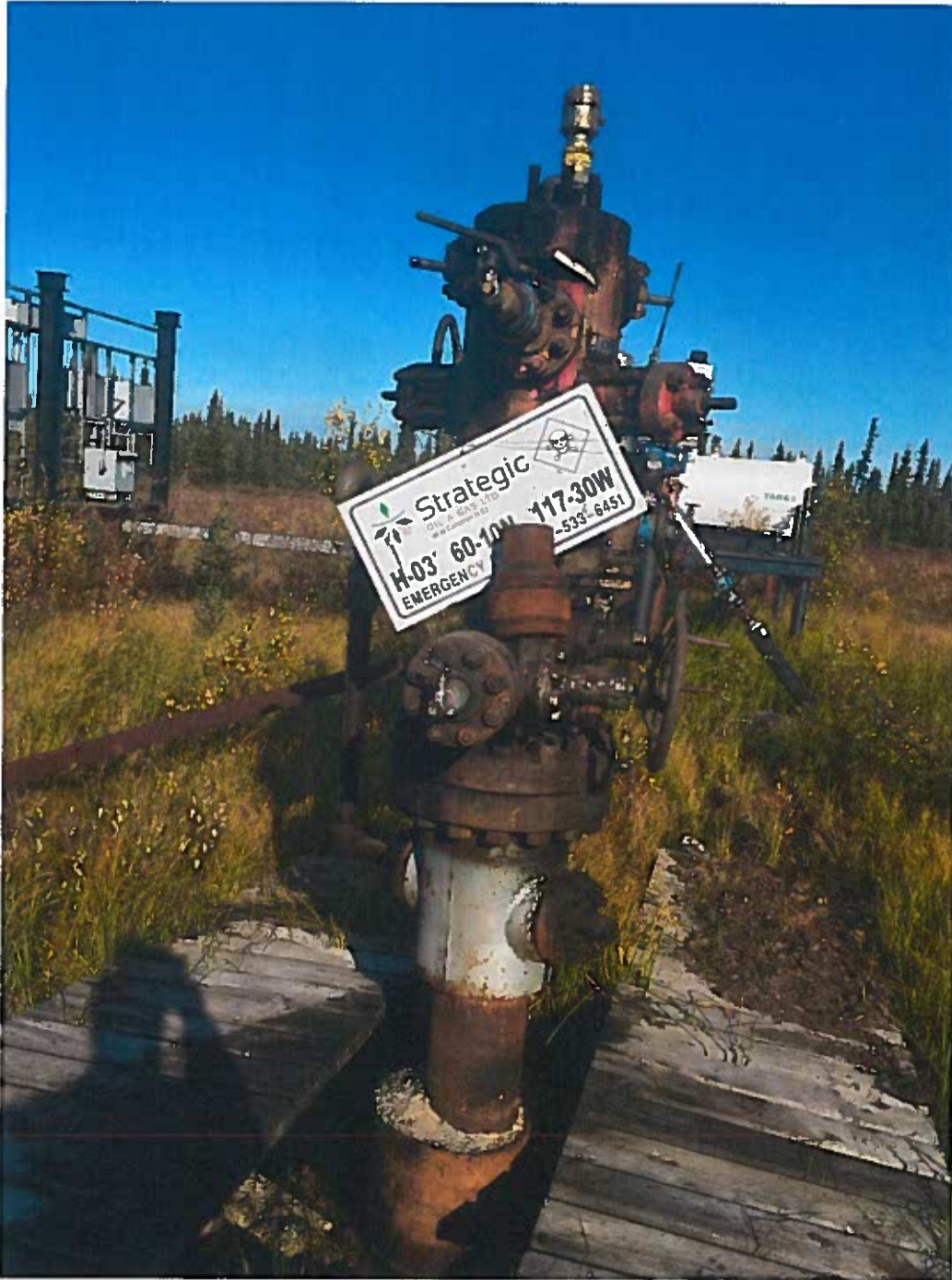
Photo #2: Well head valves were not secured. All well head valves should be secured to prevent unauthorized operation