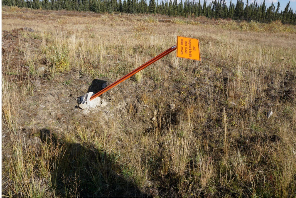
Photo #1: Cameron J-74 (WID 2032) – Example of improperly installed well abandonment sign.