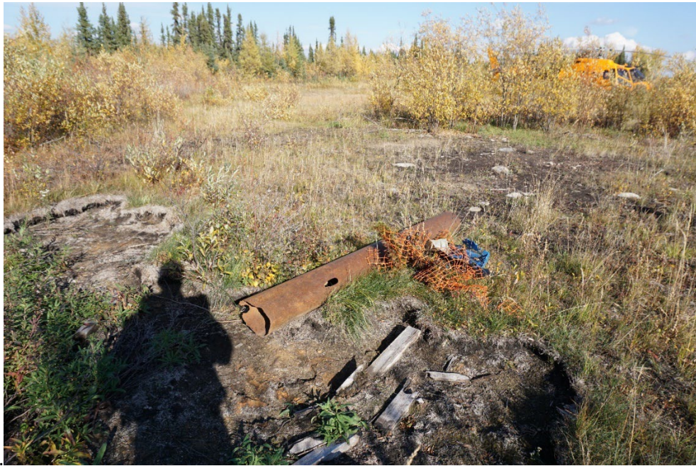
Photo #4: Cameron K-74 (WID 1972) – Example of debris requiring removal.