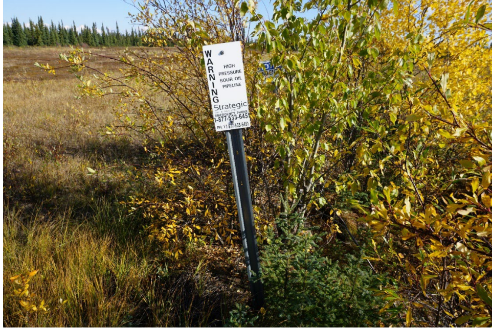
Photo #3: Cameron C-74 (WID 1939) – Example of pipeline identification and hazard signs requiring removal.