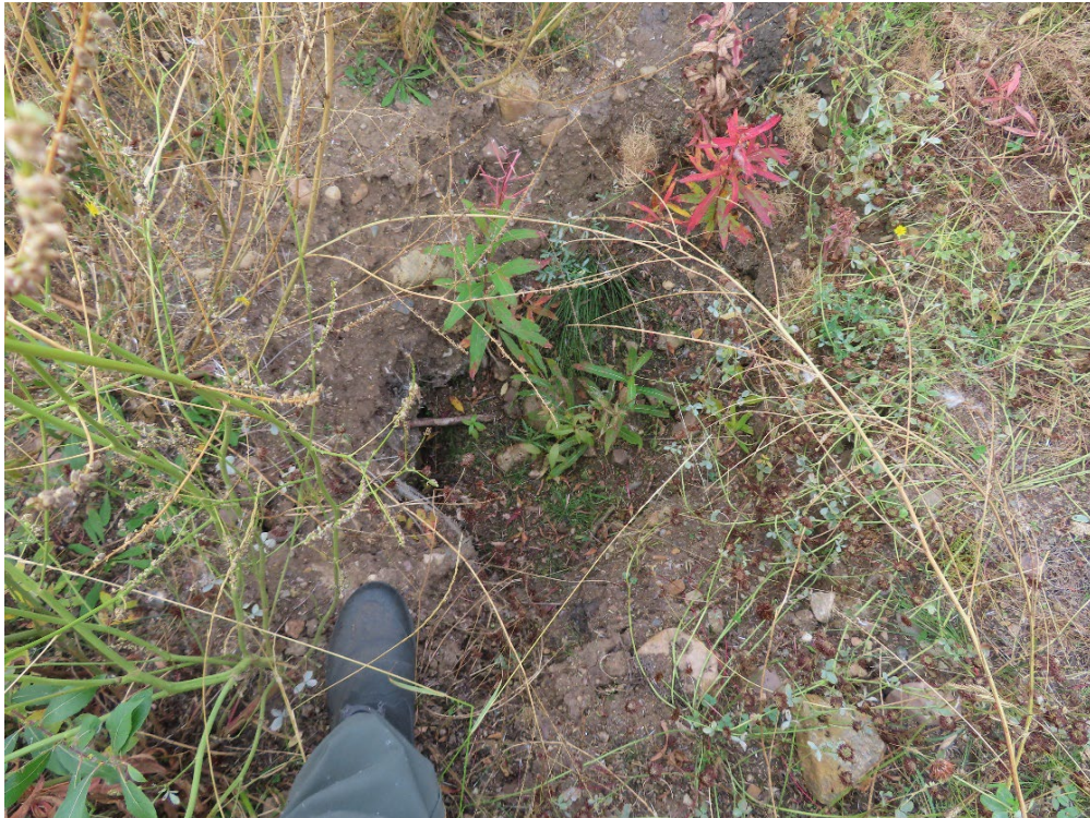
Photo # 6: Cameron L-47 (WID 1736) - Liner and grounding cable requiring removal.