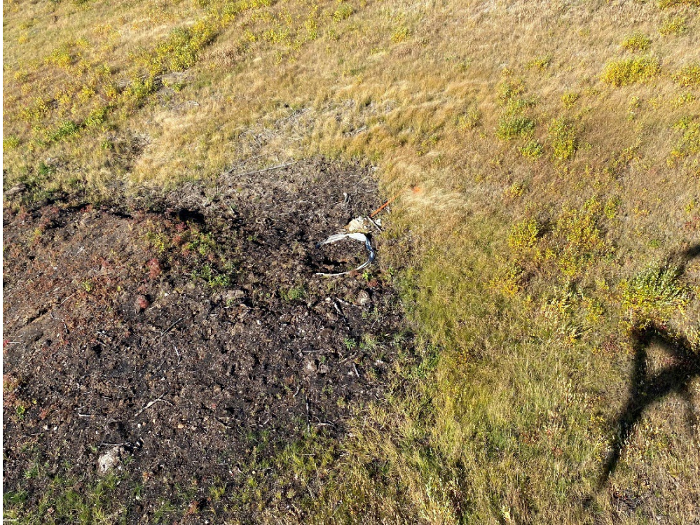
Photo #5: Cameron A-68 (WID 1746) – Example of cellar requiring removal and improperly installed well abandonment sign.